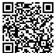
Illustration for identification purposes only, measurements are approximate, not to scale. Produced for Trend & Thomas

Whilst these particulars are intended to give a fair description of the property, their accuracy is not guaranteed. Any purchaser must satisfy themselves as to the correctness of statements contained therein. These particulars do not constitute an offer or contract, and statements therein are made without responsibility, or warranty on the part of the vendor or Trend & Thomas, neither of whom are liable to expenses incurred should the property no longer be available.