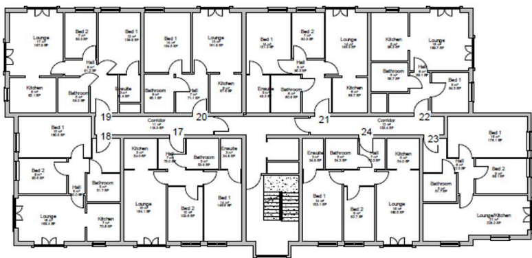
1 Second Floor