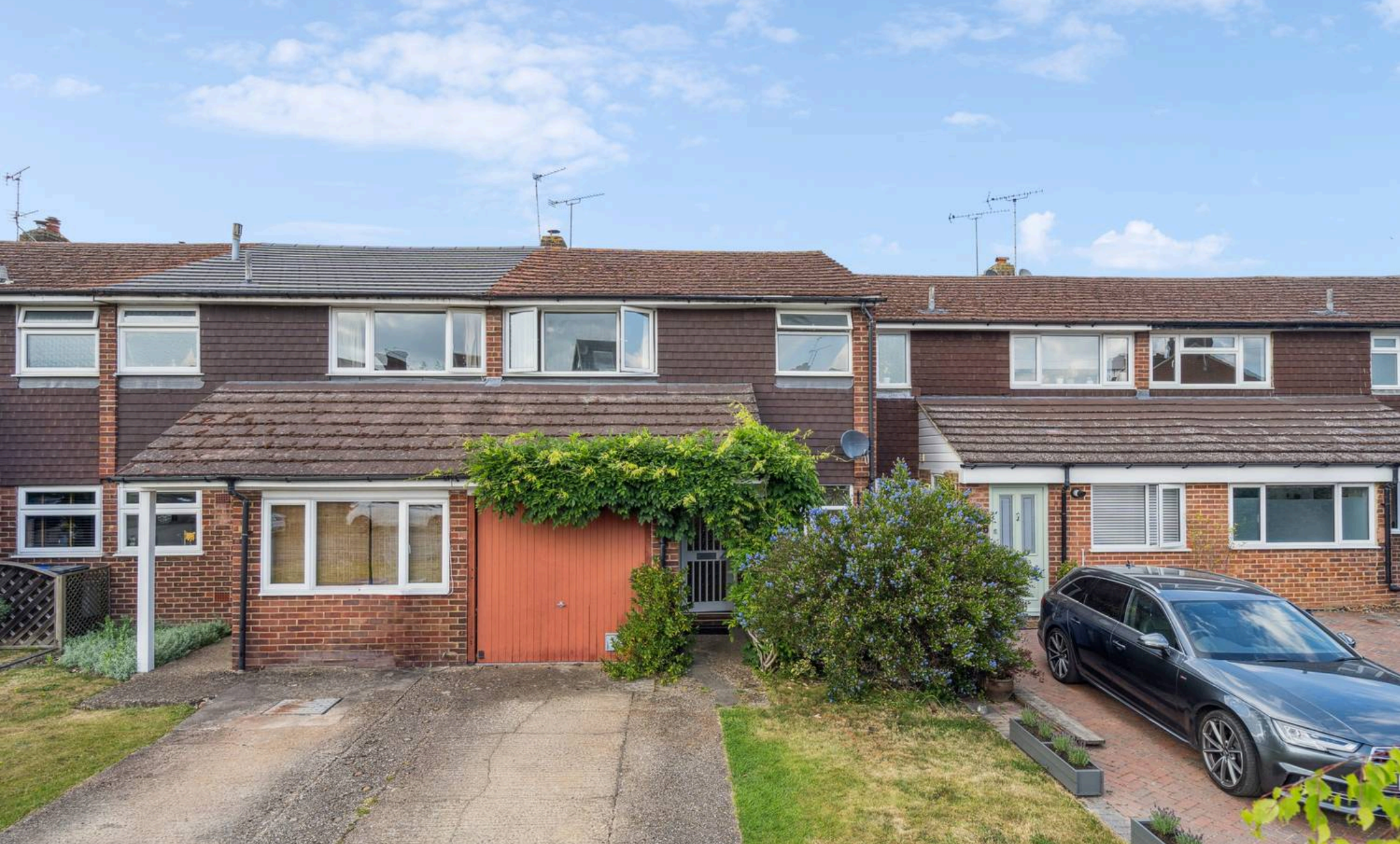
12 White Hart Meadow, Beaconsfield - HP9 1LN £586,732