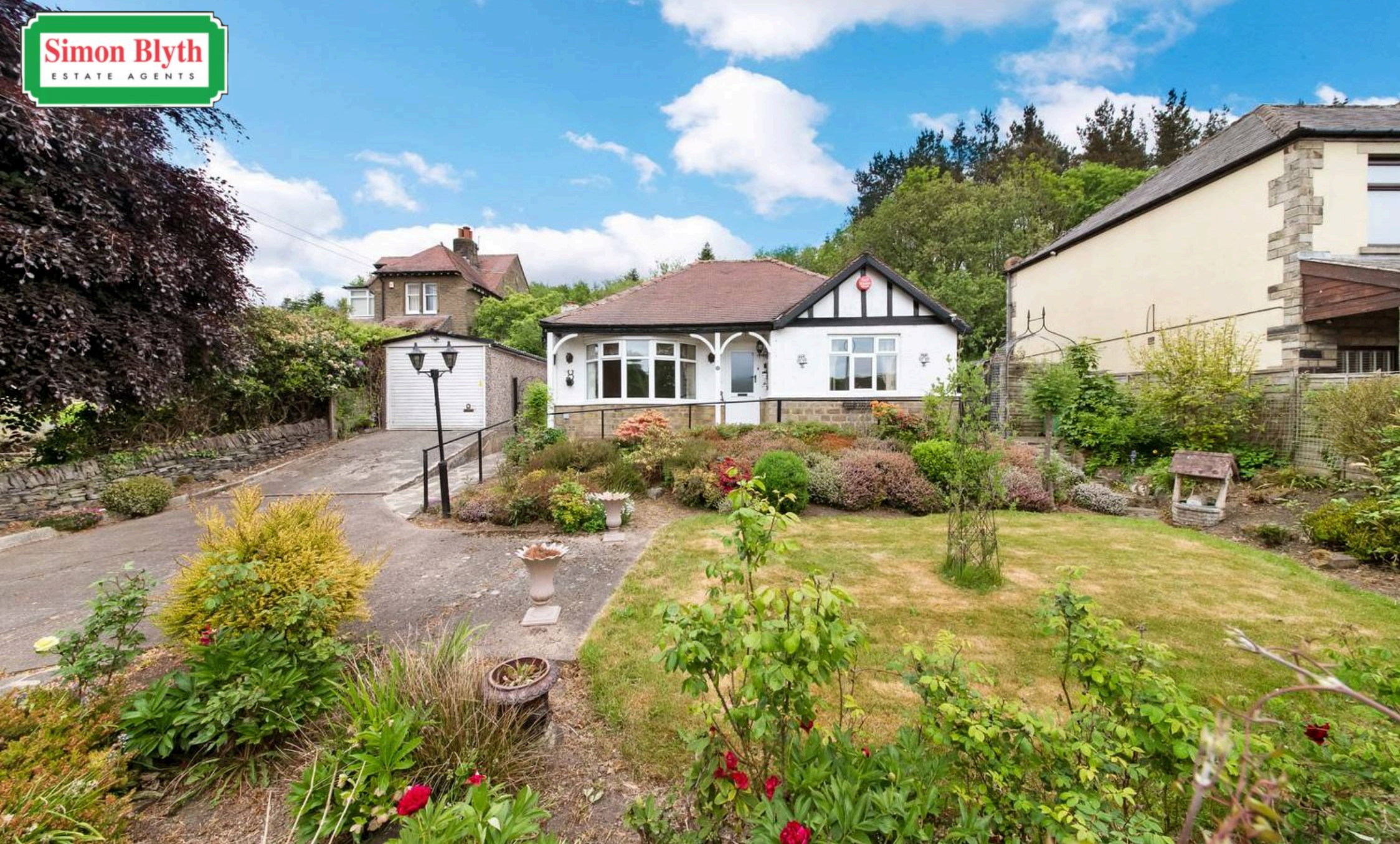
Meadow Bank, Abbey Road Shepley, Huddersfield, HD8 8EP