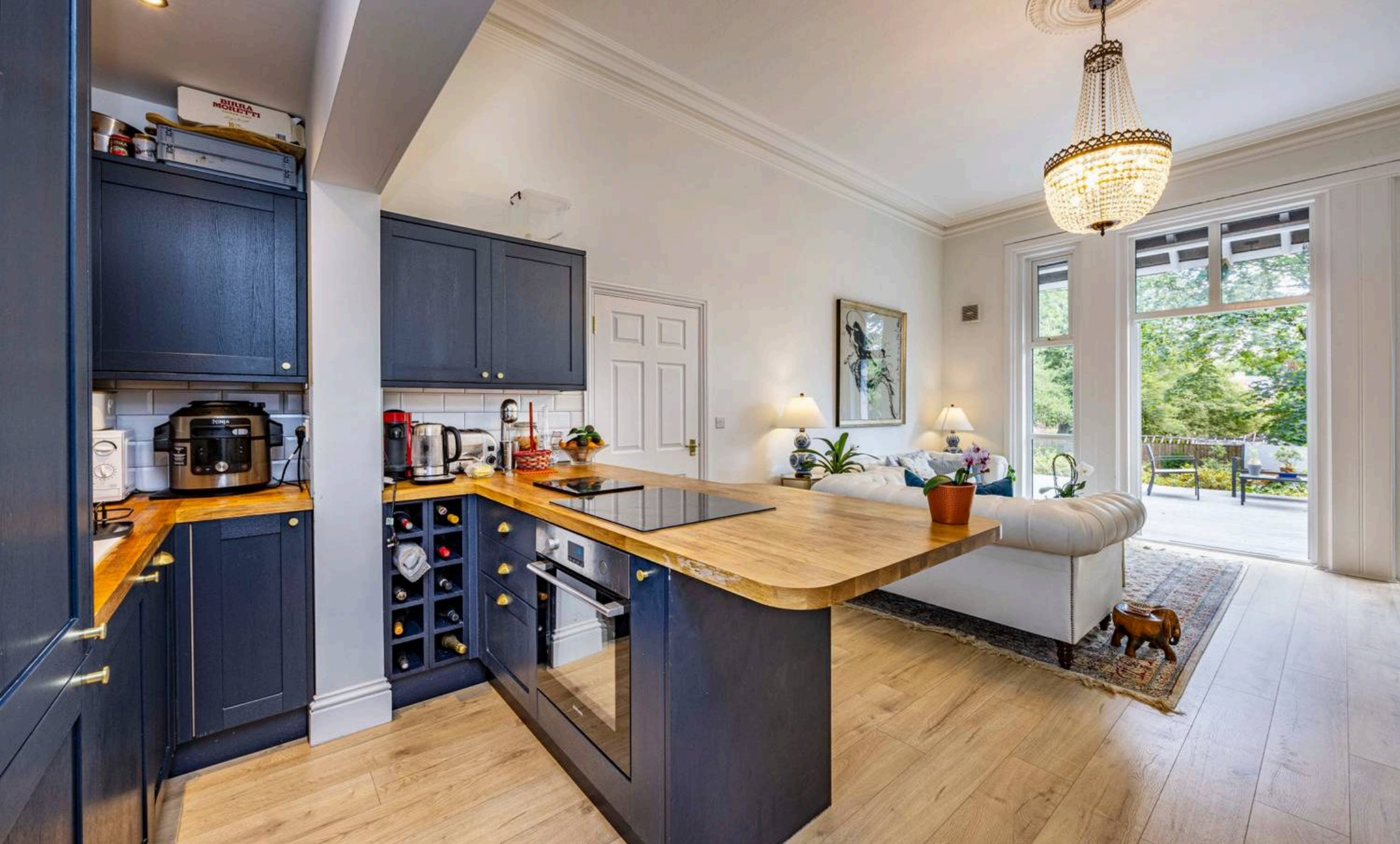
Cavendish Crescent South, Nottingham £1,825 pcm