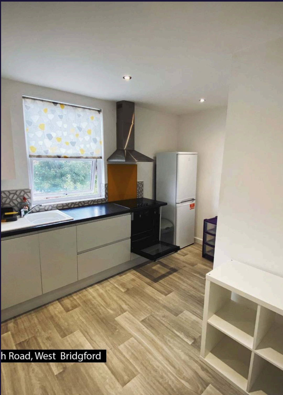
h Road, West Bridgford