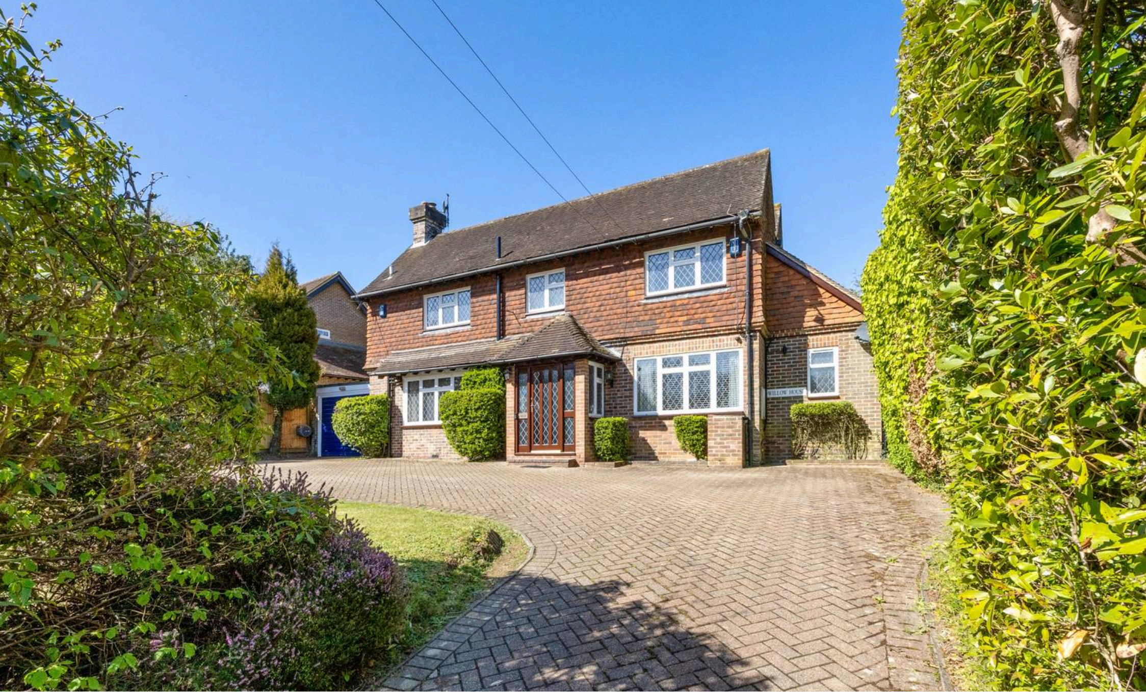
Willow House, Coopers Green, Uckfield, TN22 3AA

£875,000 MANSELL McTAGGART — Trusted since 1947 —