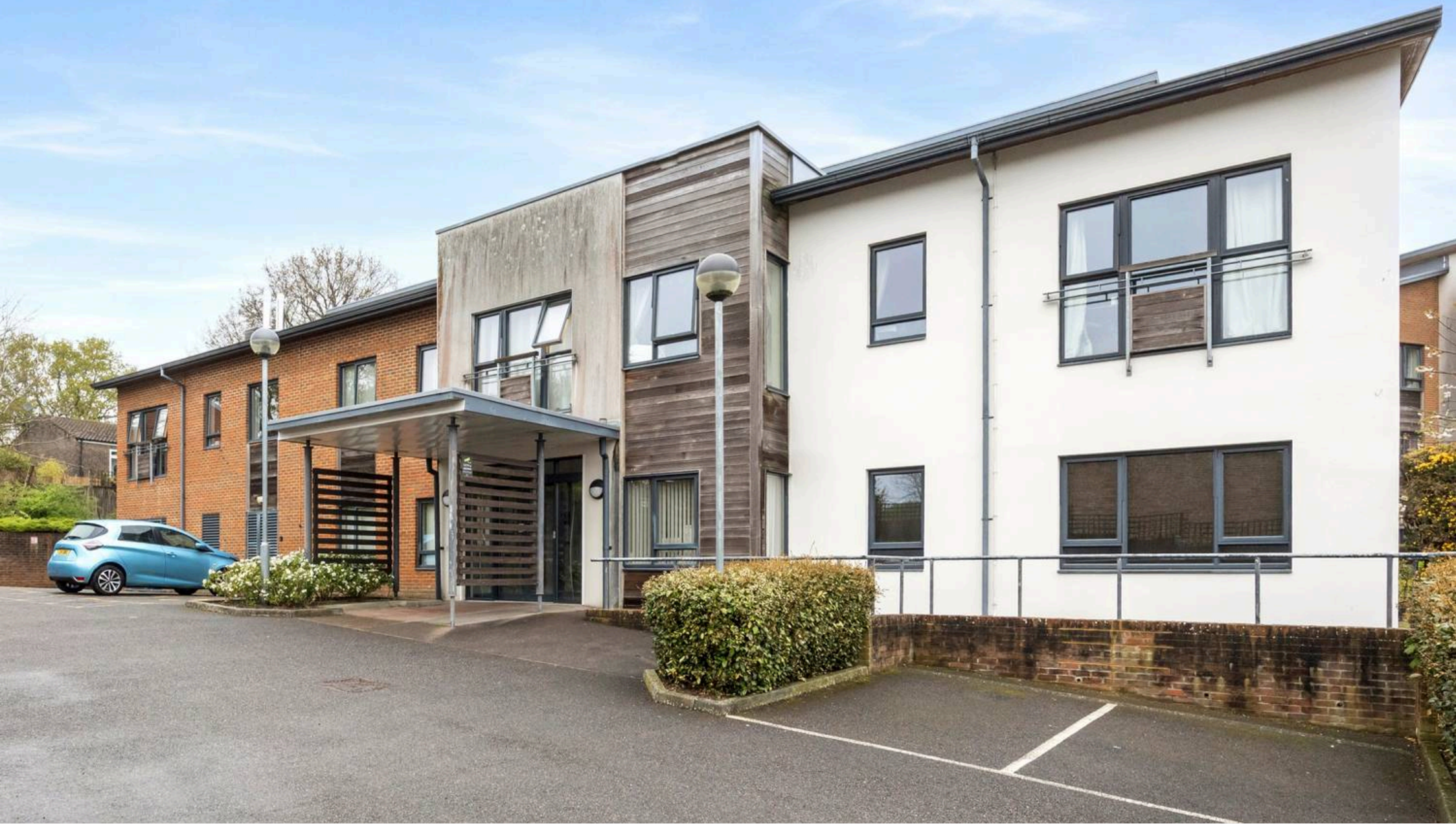
Flat 34, Margaret House Lealands Drive, Uckfield Uckfield