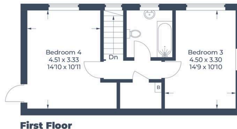
Illustration for identification purposes only, measurements are approximate, not to scale. © CJ Property Marketing Produced for Tim Russ & Co - Thame