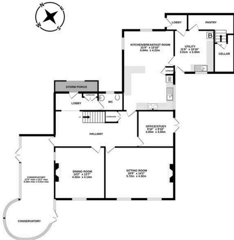
GROUND FLOOR 1708 sq.ft. (158.7 sq.m.) approx.