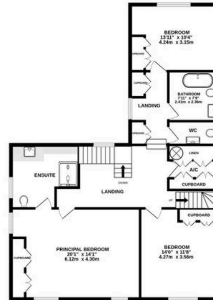
1ST FLOOR 1076 sq.ft. (100.0 sq.m.) approx.