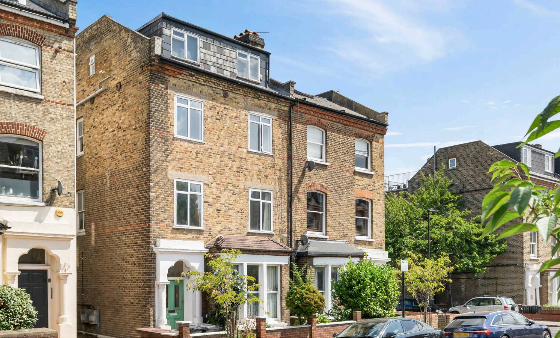
Alexandra Grove, N4 2LG £540,000