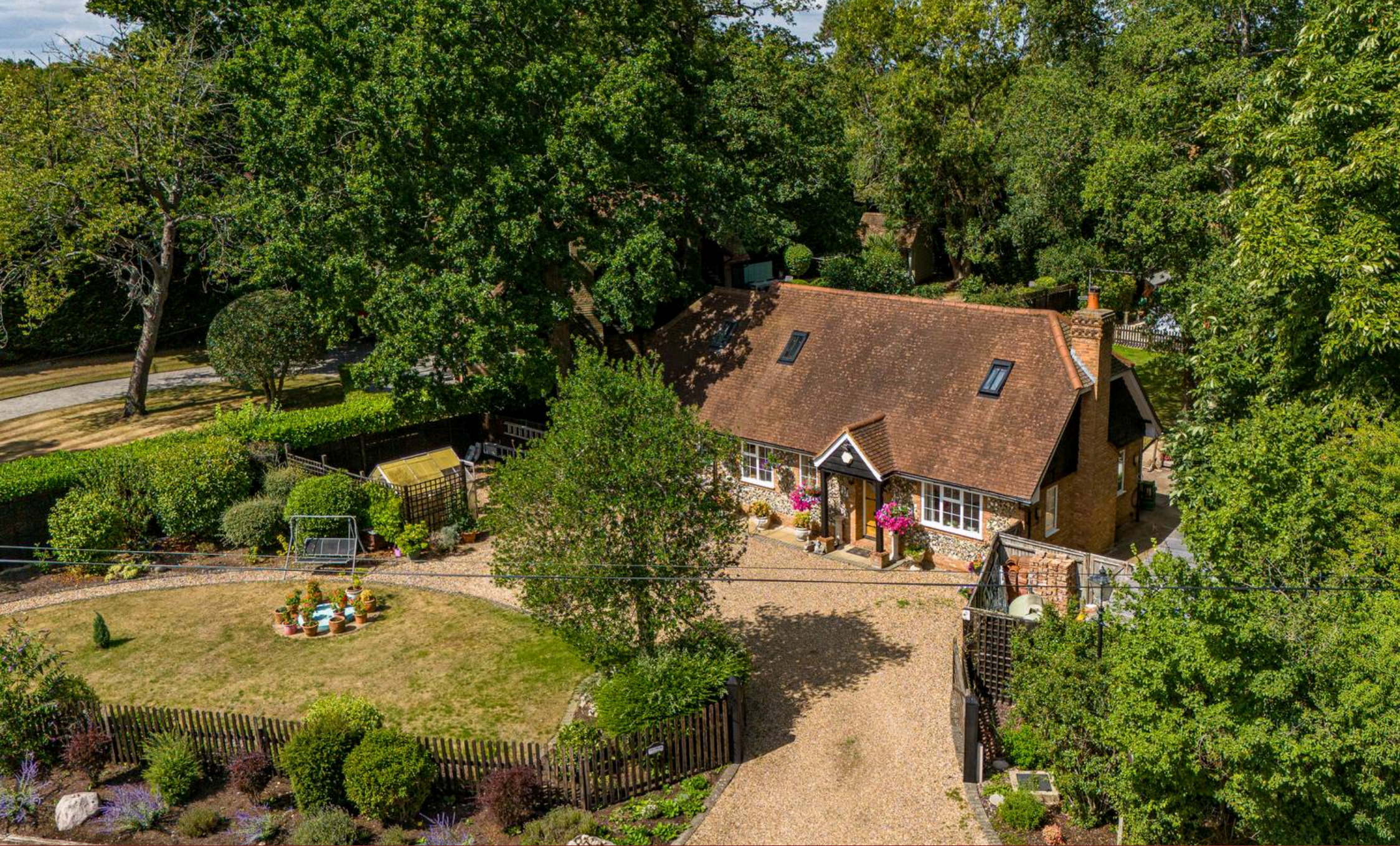
Woodland Cottage Wapseys Lane, Hedgerley - SL2 3XG £1,150,000