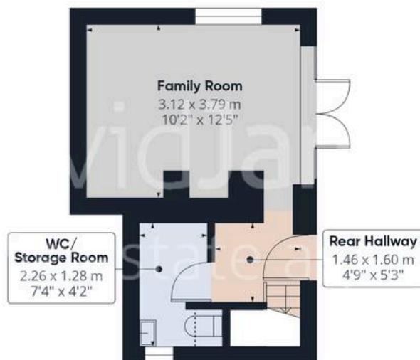
Floor -1 Building 1