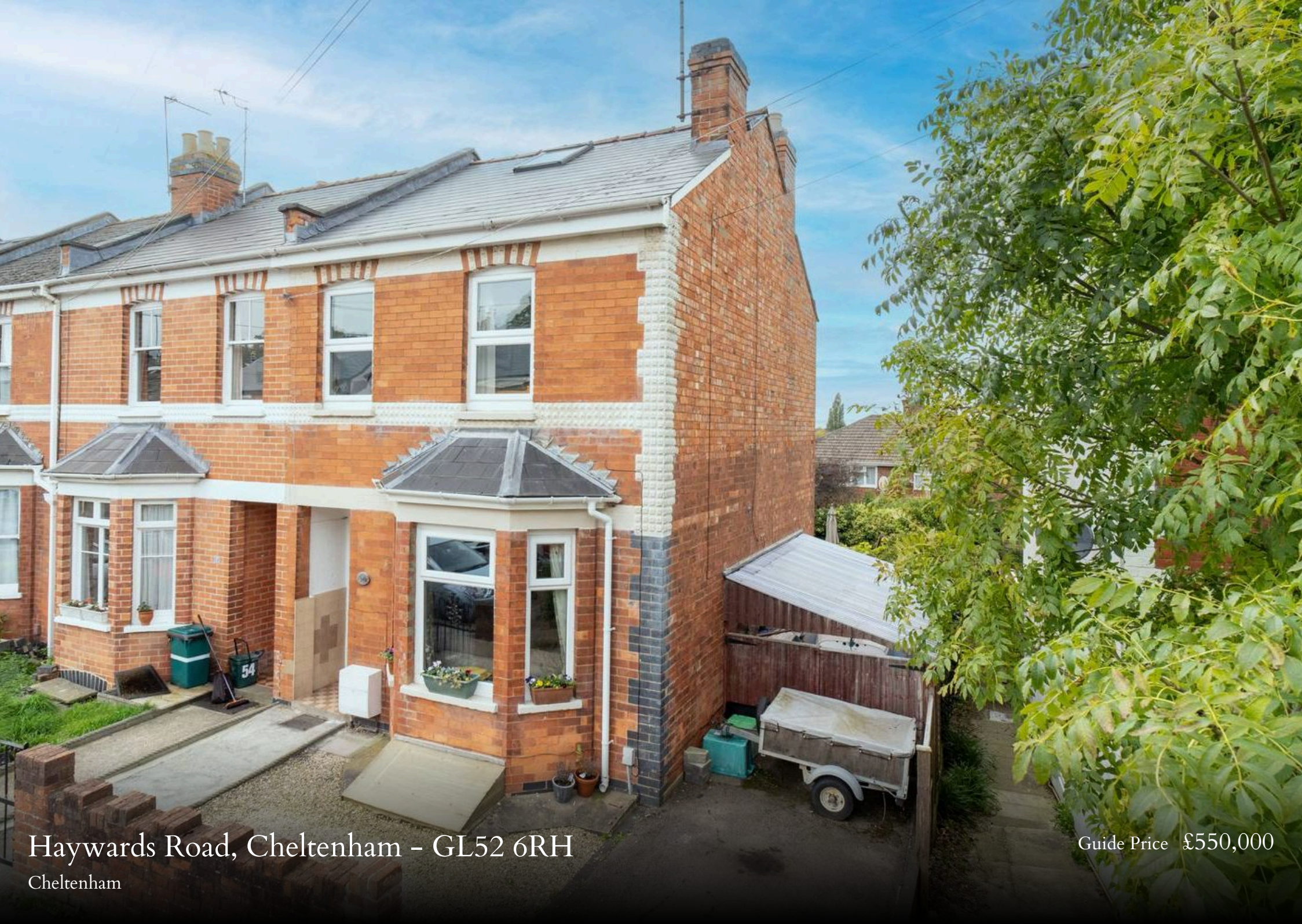
Haywards Road, Cheltenham - GL52 6RH Cheltenham