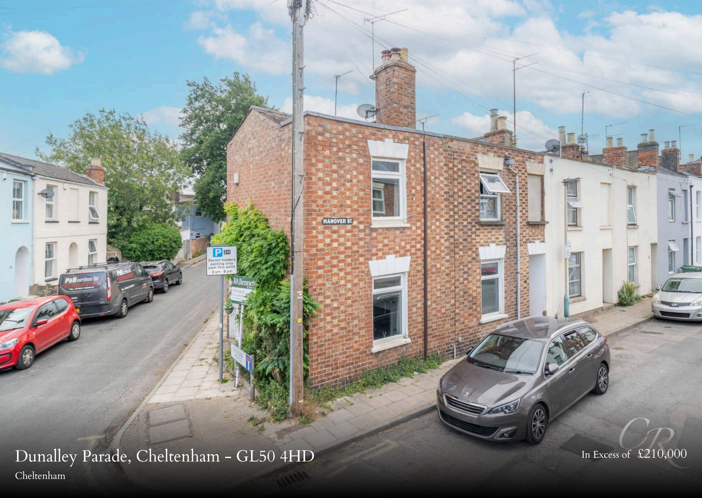
Dunalley Parade, Cheltenham – GL50 4HD Cheltenham