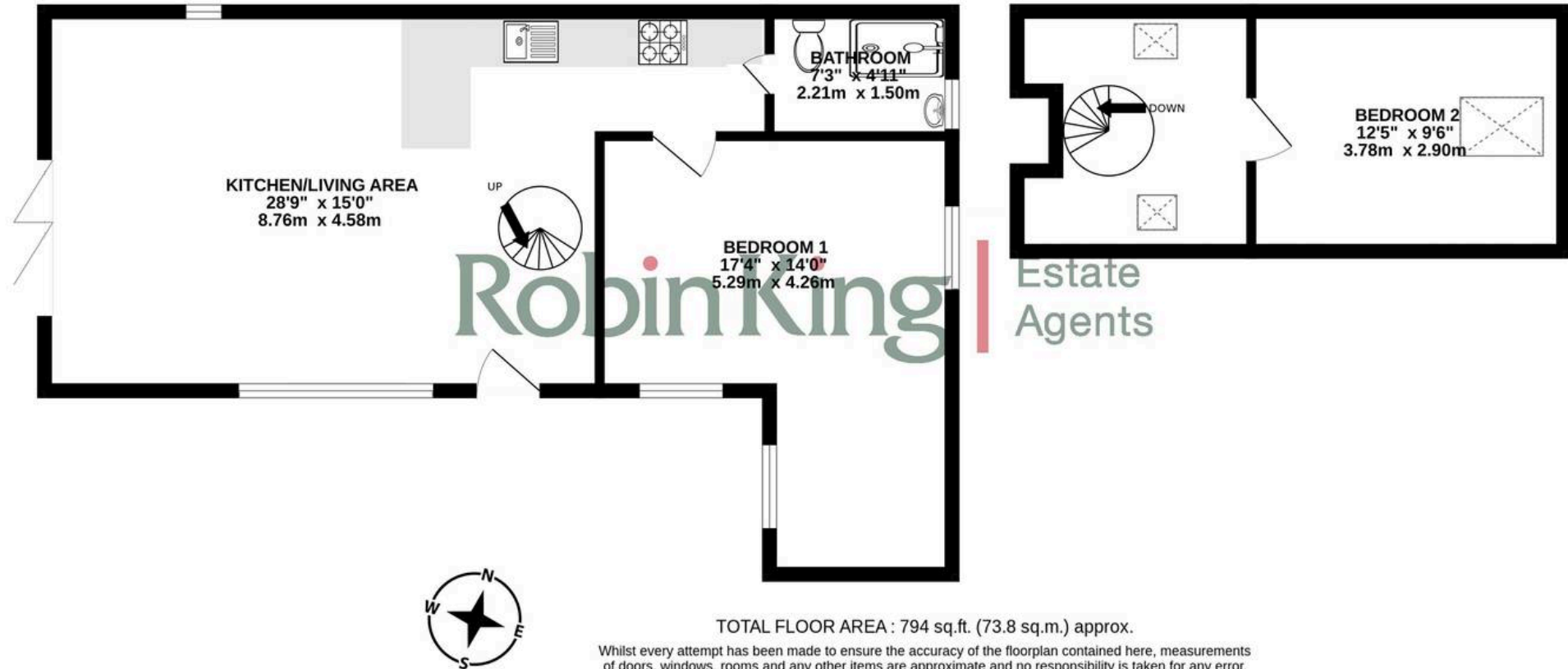
1ST FLOOR 201 sq.ft. (18.7 sq.m.) approx.

Whilst every attempt has been made to ensure the accuracy of the floorplan contained here, measurements of doors, windows, rooms and any other items are approximate and no responsibility is taken for any error, omission or mis-statement. This plan is for illustrative purposes only and should be used as such by any prospective purchaser. The services, systems and appliances shown have not been tested and no guarantee as to their operability or efficiency can be given. Made with Metropix ©2025