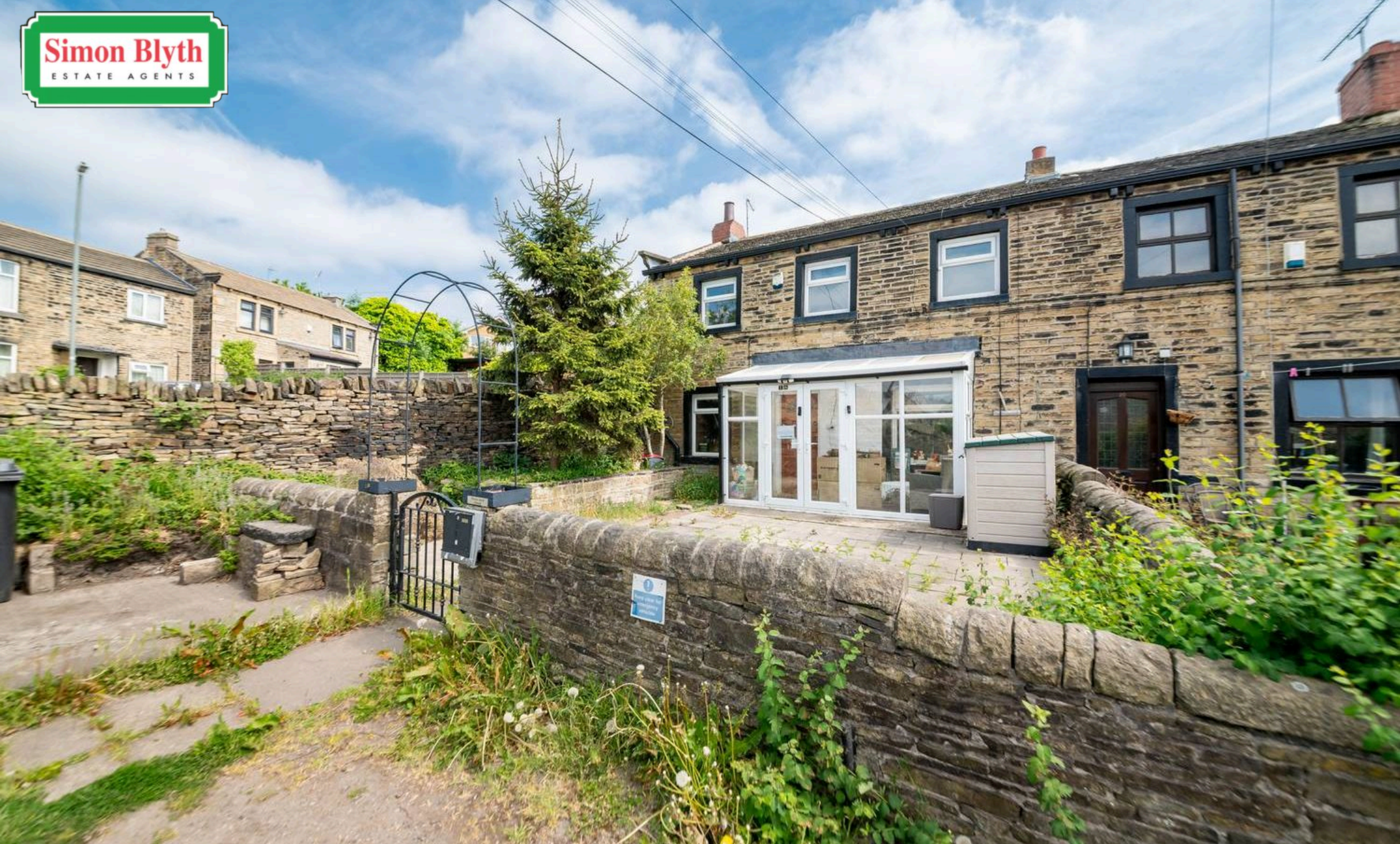
Cockley Hill Lane, Kirkheaton Huddersfield, HD5 0HH