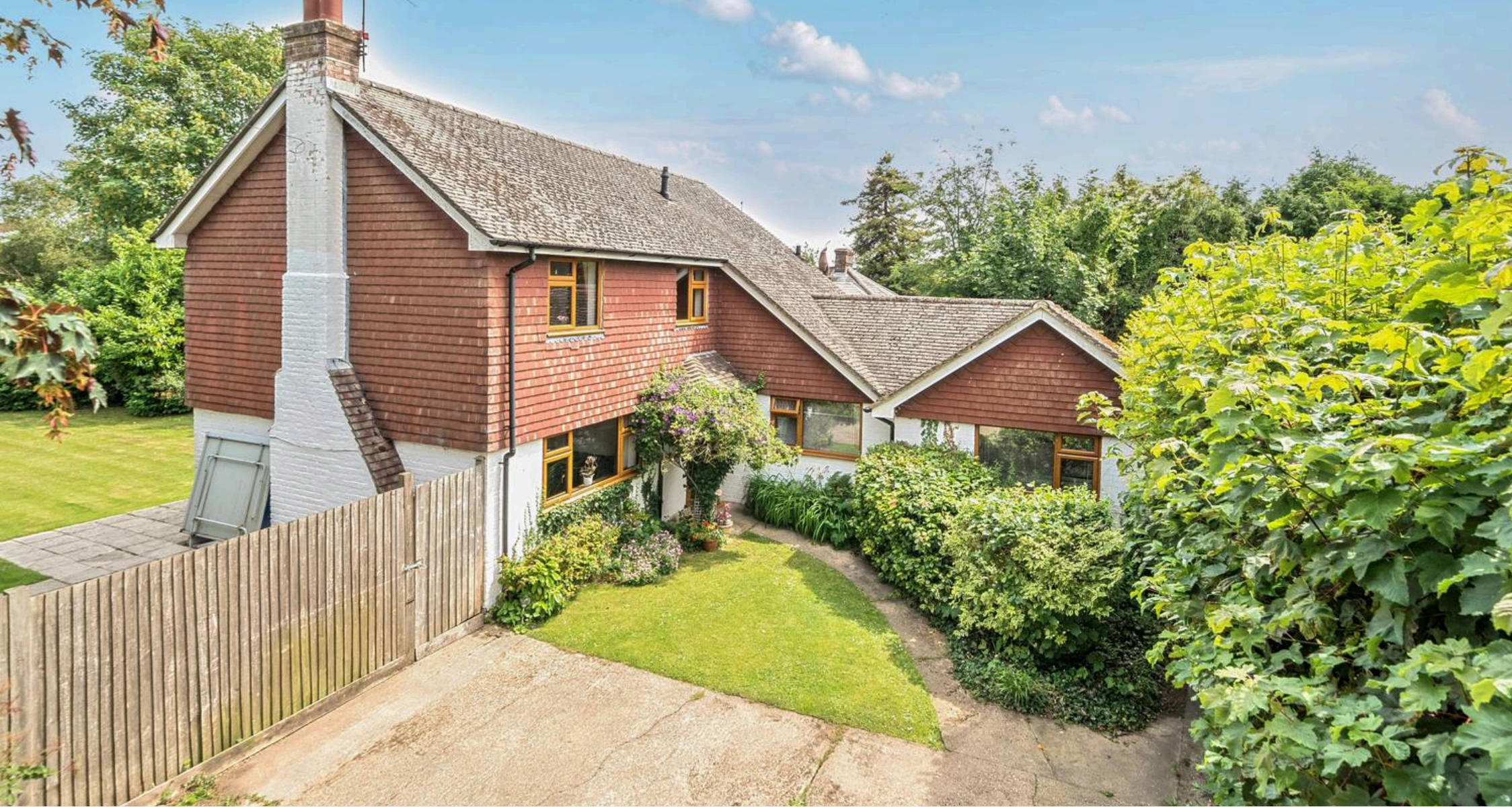
Millfield Cottage South Rough, Newick BN8 4NW