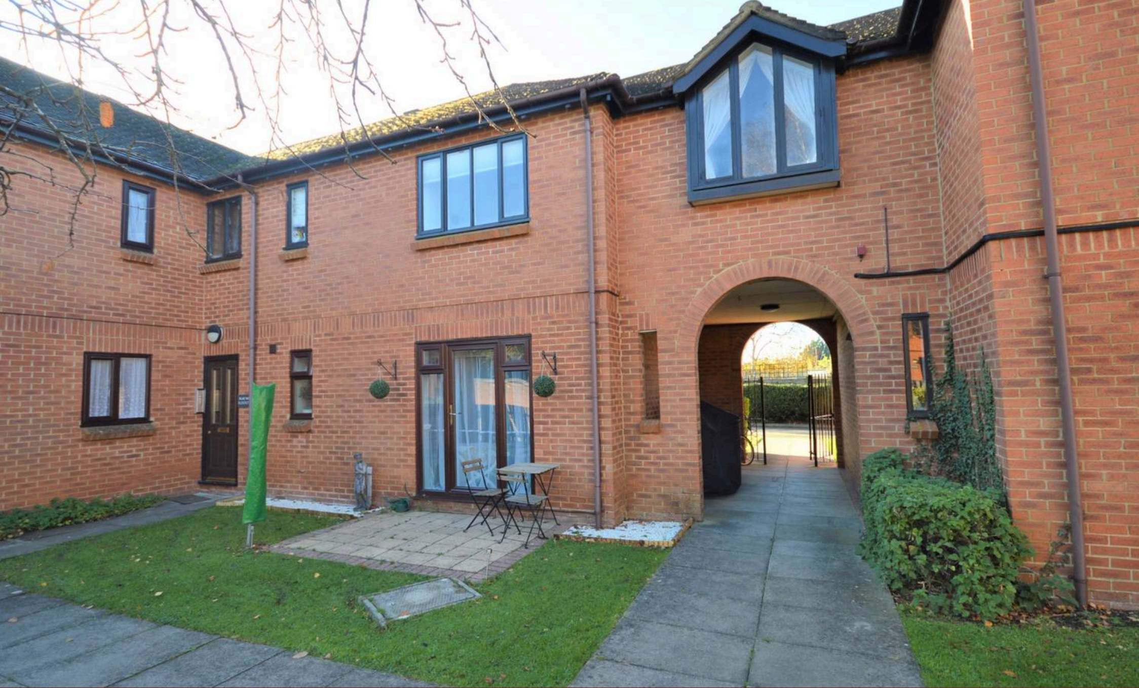
Plested Court, Stoke Mandeville £200,000