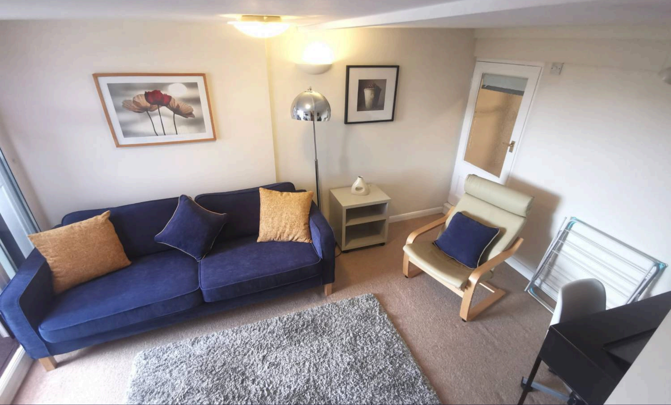
Newcastle Drive, Nottingham £1,005 pcm