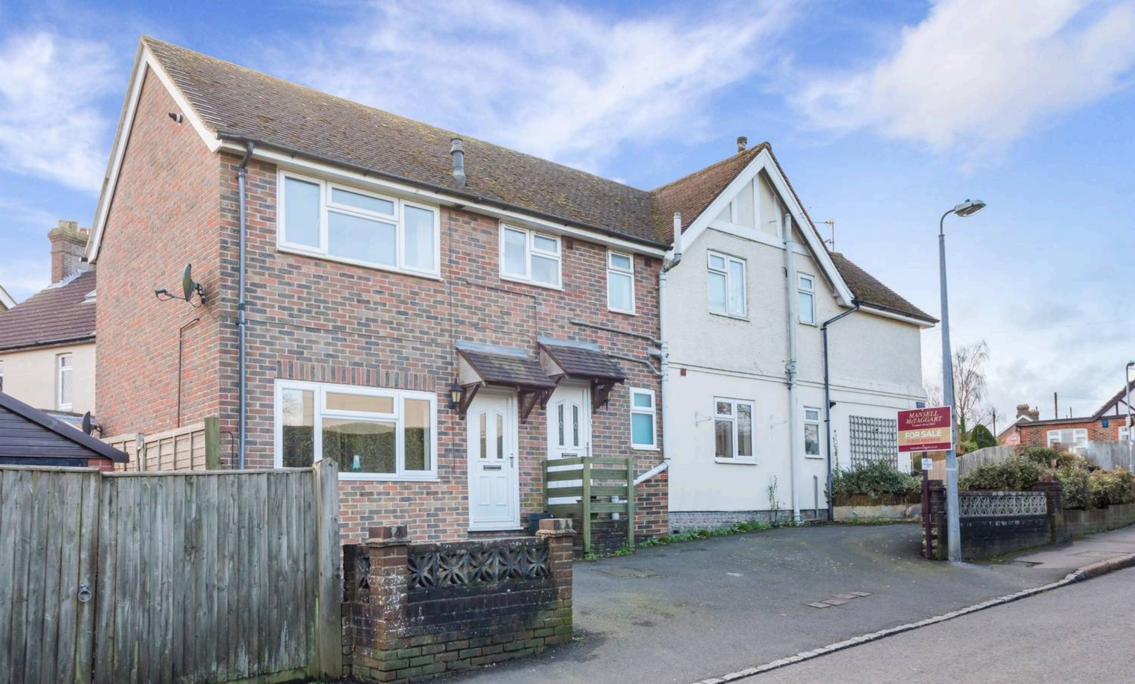
3 Canterbury House, Queens Road, Crowborough TN6 1PT

£1,250 PCM MANSELL McTAGGART — Trusted since 1947 —