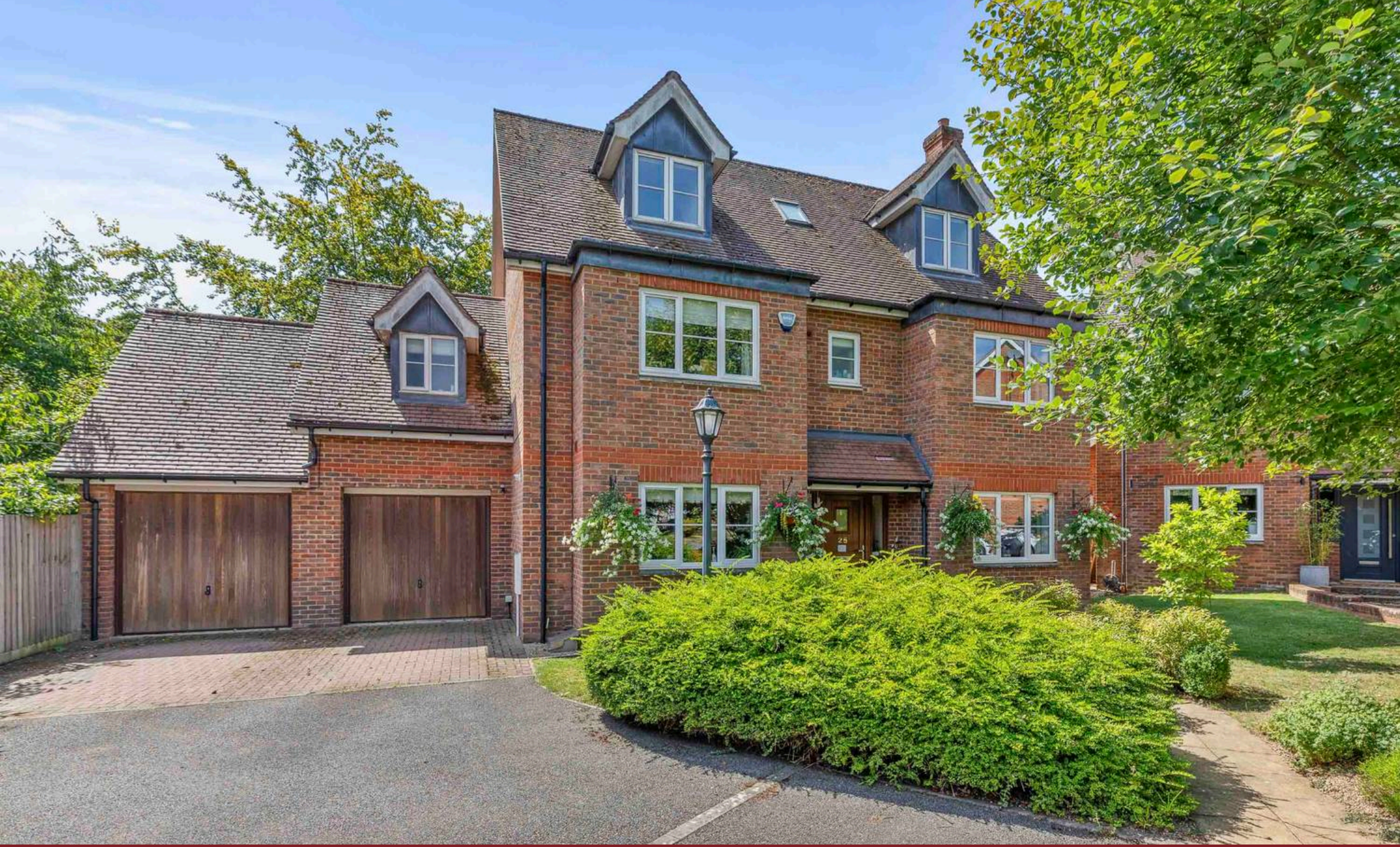
25 Willow Chase, Hazlemere - HP15 7QP £1,250,000