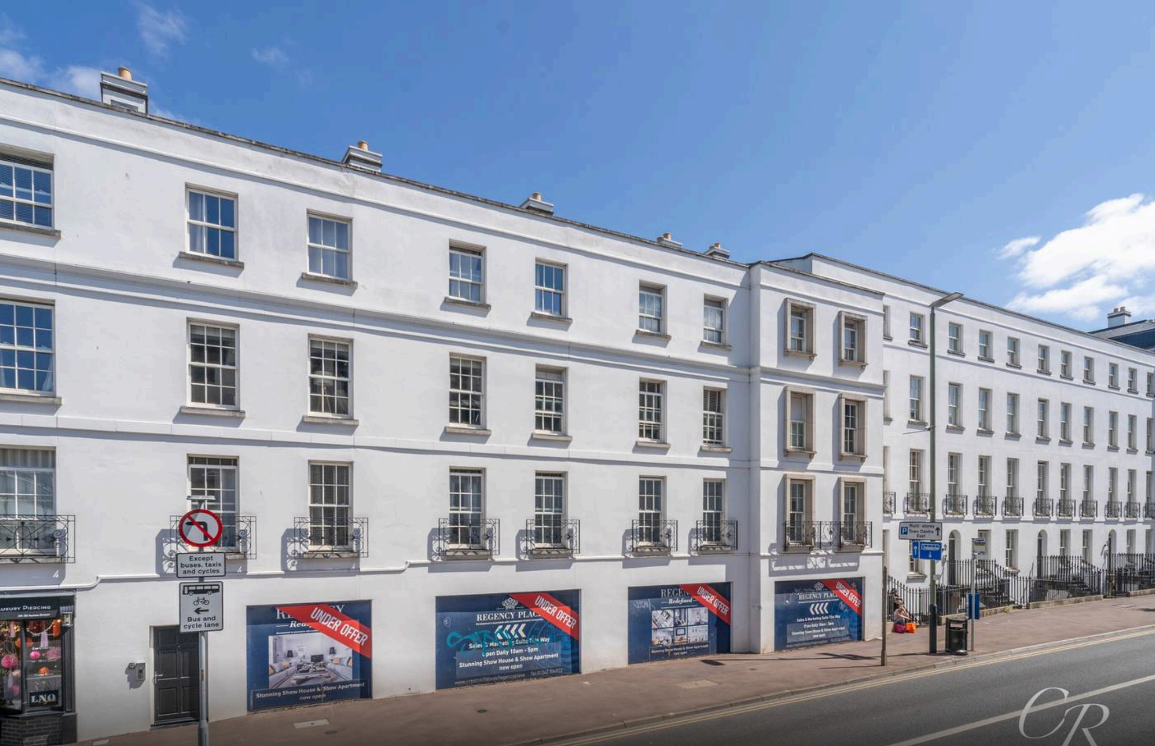
Prince Regent Mews, Cheltenham - GL52 2AQ