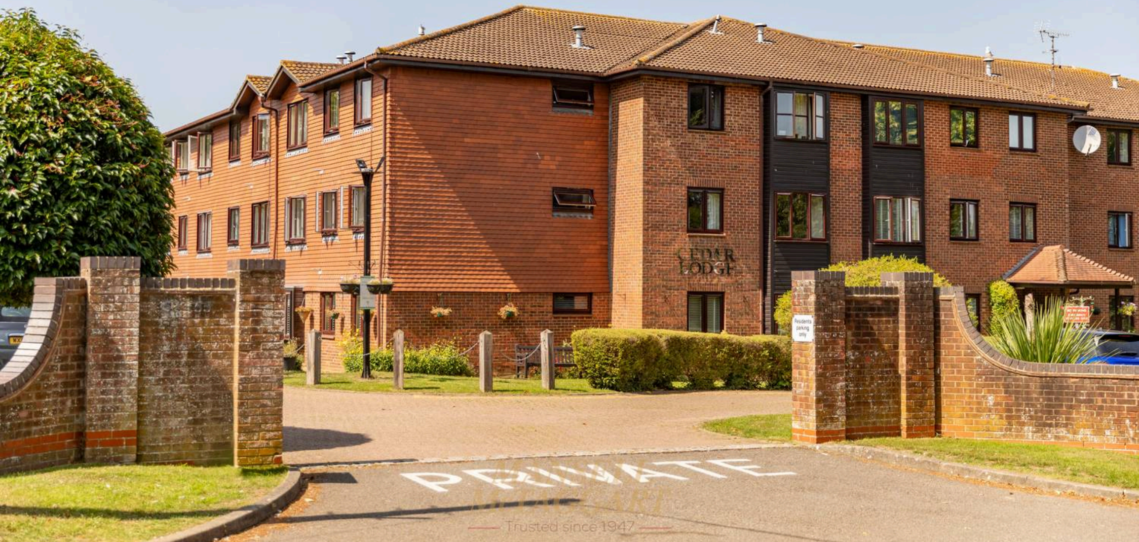
Cedar Lodge, Brighton Road, Southgate £150,000