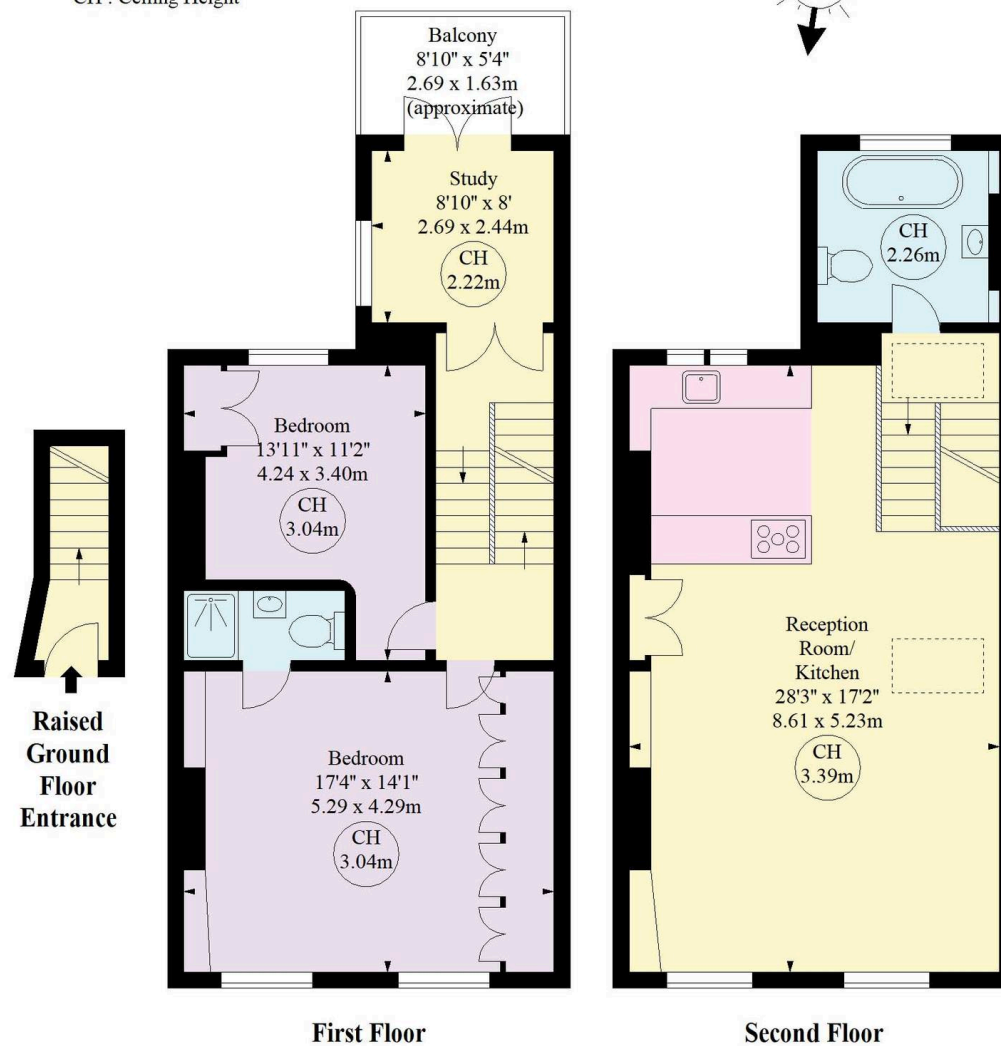
Illustration For Identification Purposes Only. Not To Scale

* As Defined by RICS - Code of Measuring Practice