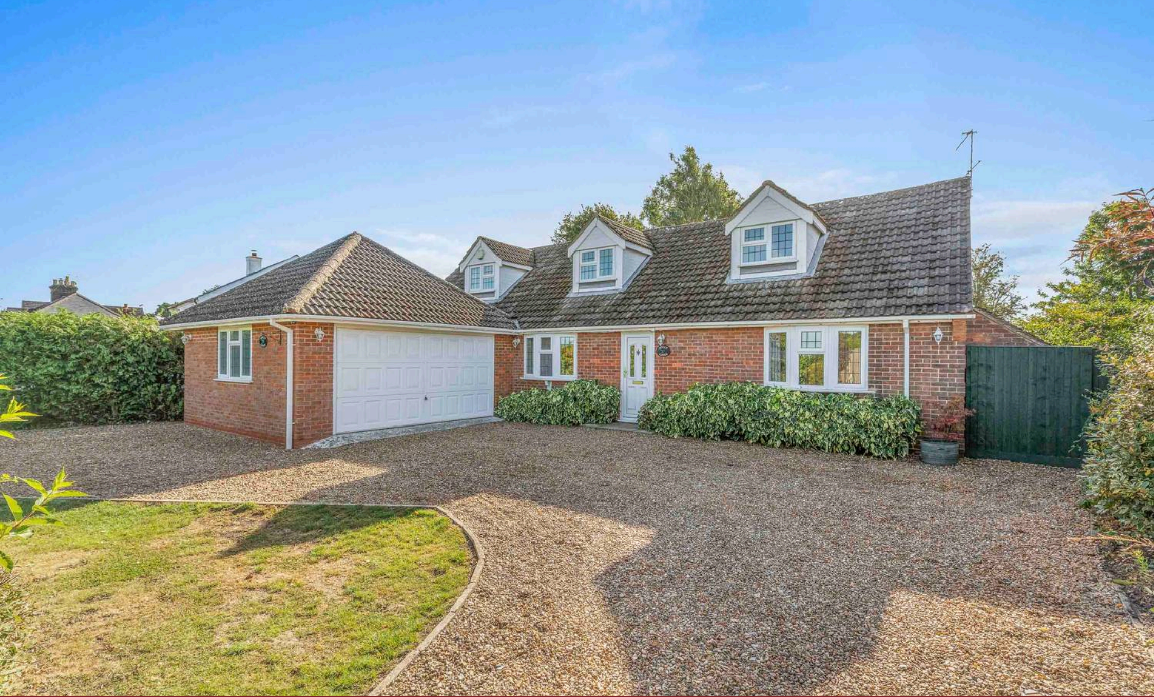
Holly Lodge North Road, Widmer End - HP15 6ND £975,000