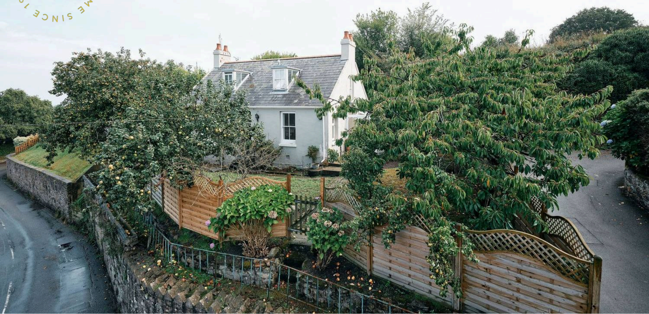
La Fontaine Cottage La Rue Du Champ, Grouville £795,000

BROADLANDS FINDING YOU A HOME SINCE 1972