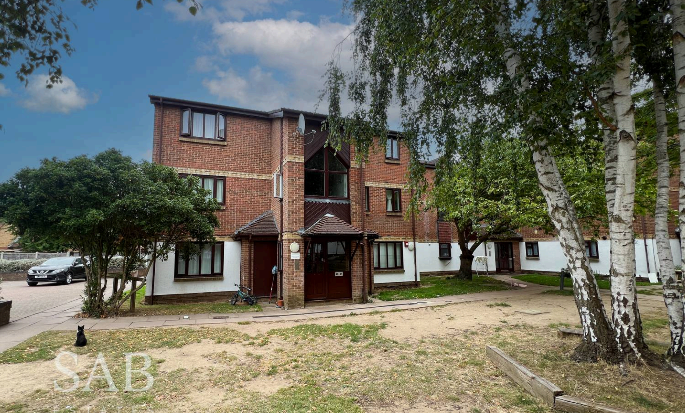
Alliance Close, Wembley £259,500