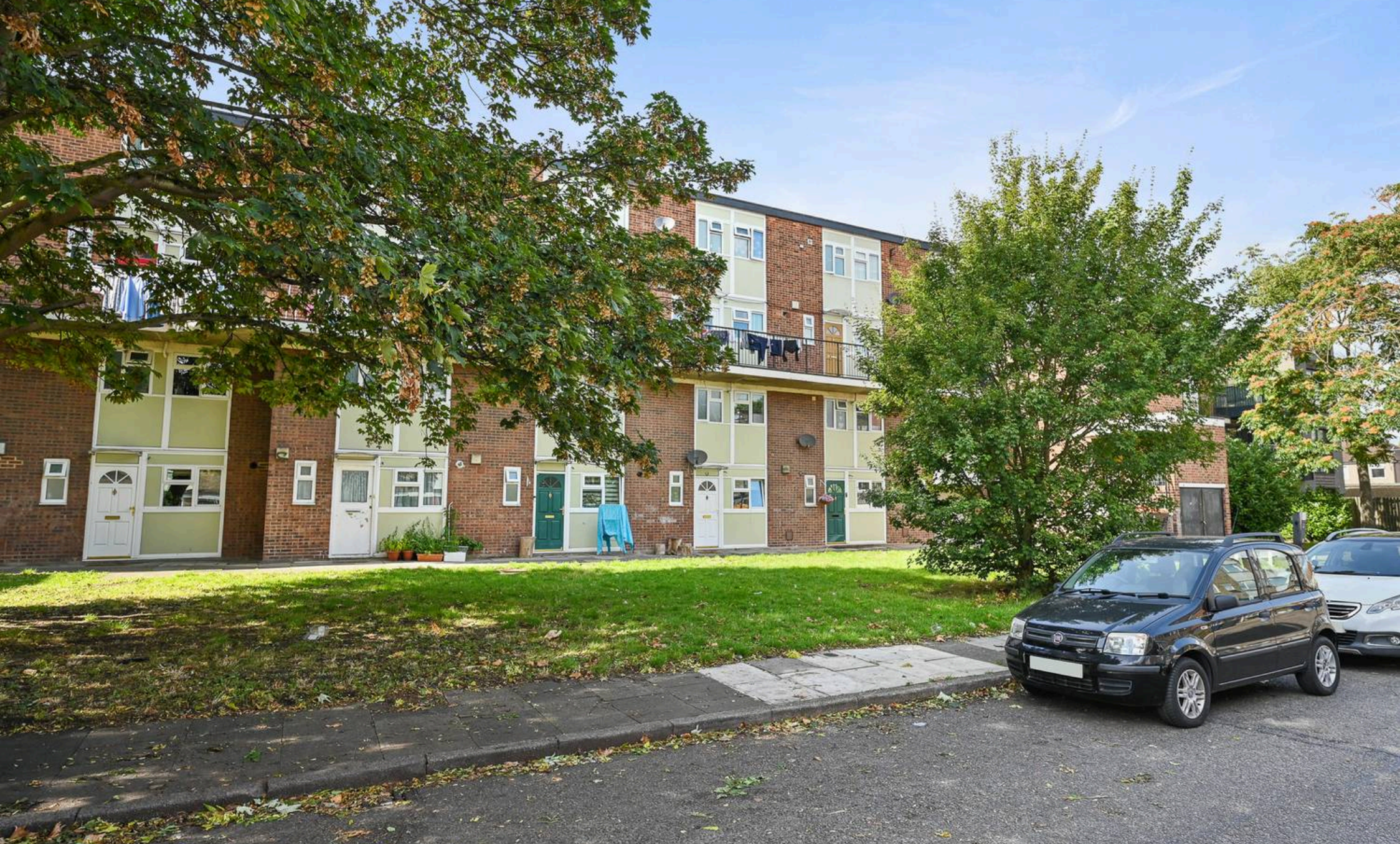
Swan Road, Southall £310,000