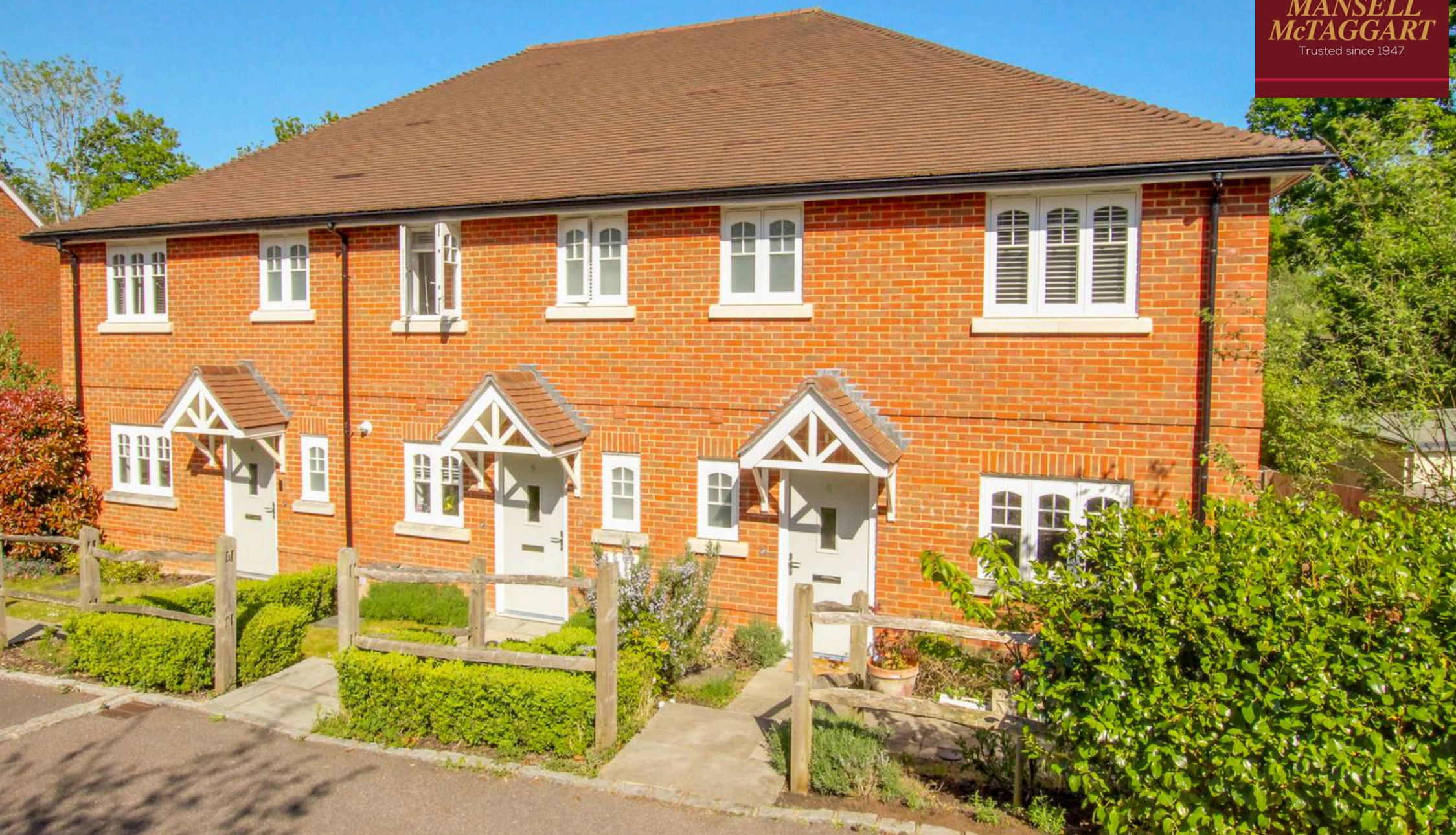
6 Primrose Way, Haywards Heath, West Sussex RH17 7GD £475,000