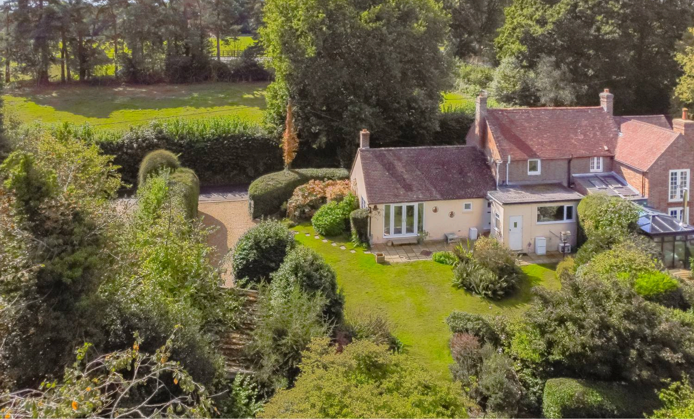
Richards Cottage, Cackle Street, Nutley. TN22 3DY Uckfield