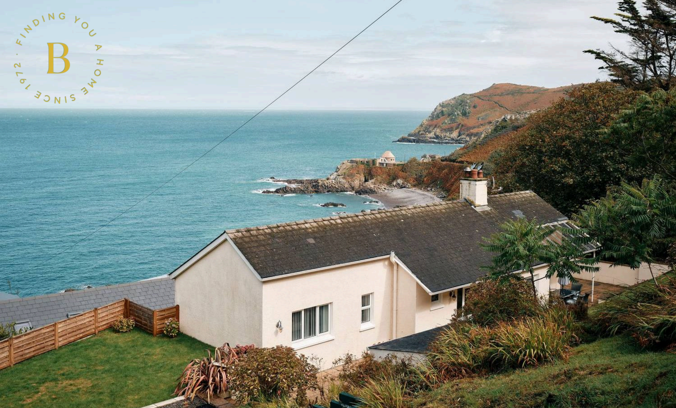
The Maples, Les Nouvelles Charrieres, St. John £1,795,000

BROADLANDS FINDING YOU A HOME SINCE 1972