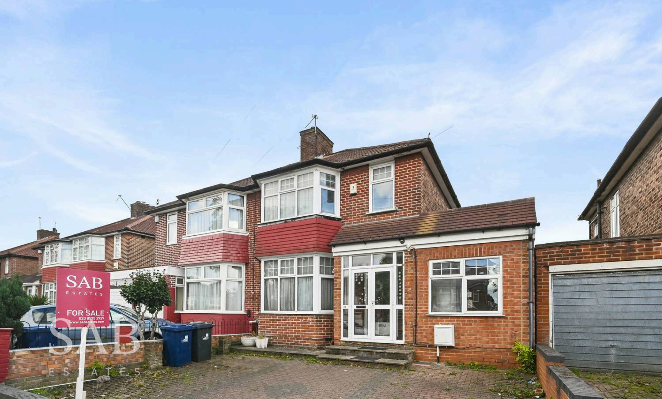
Orchard Gate, Greenford £720,000