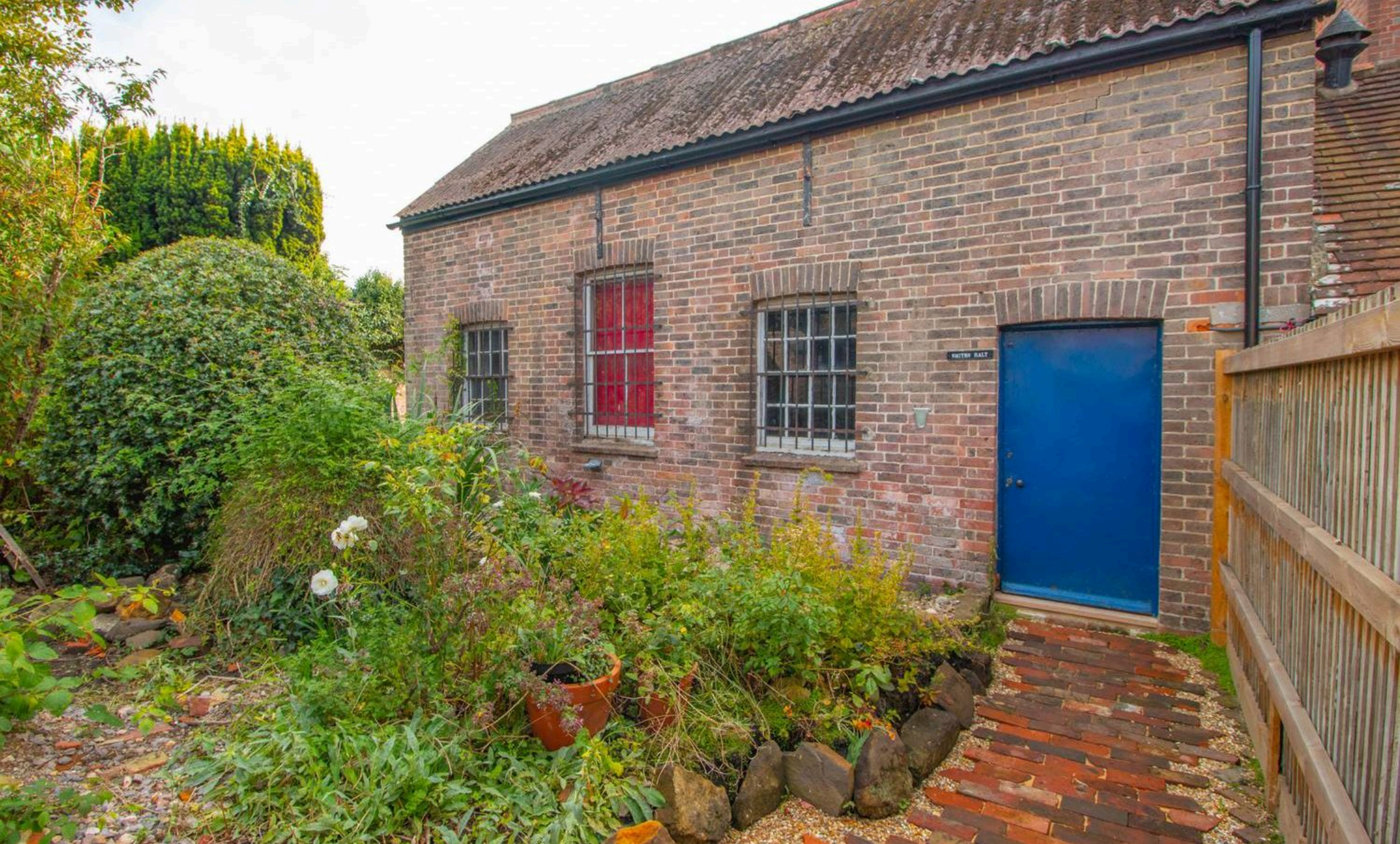
The Barn, 200 High Street, Uckfield TN22 1RD

£300 pcm MANSELL McTAGGART — Trusted since 1947 —