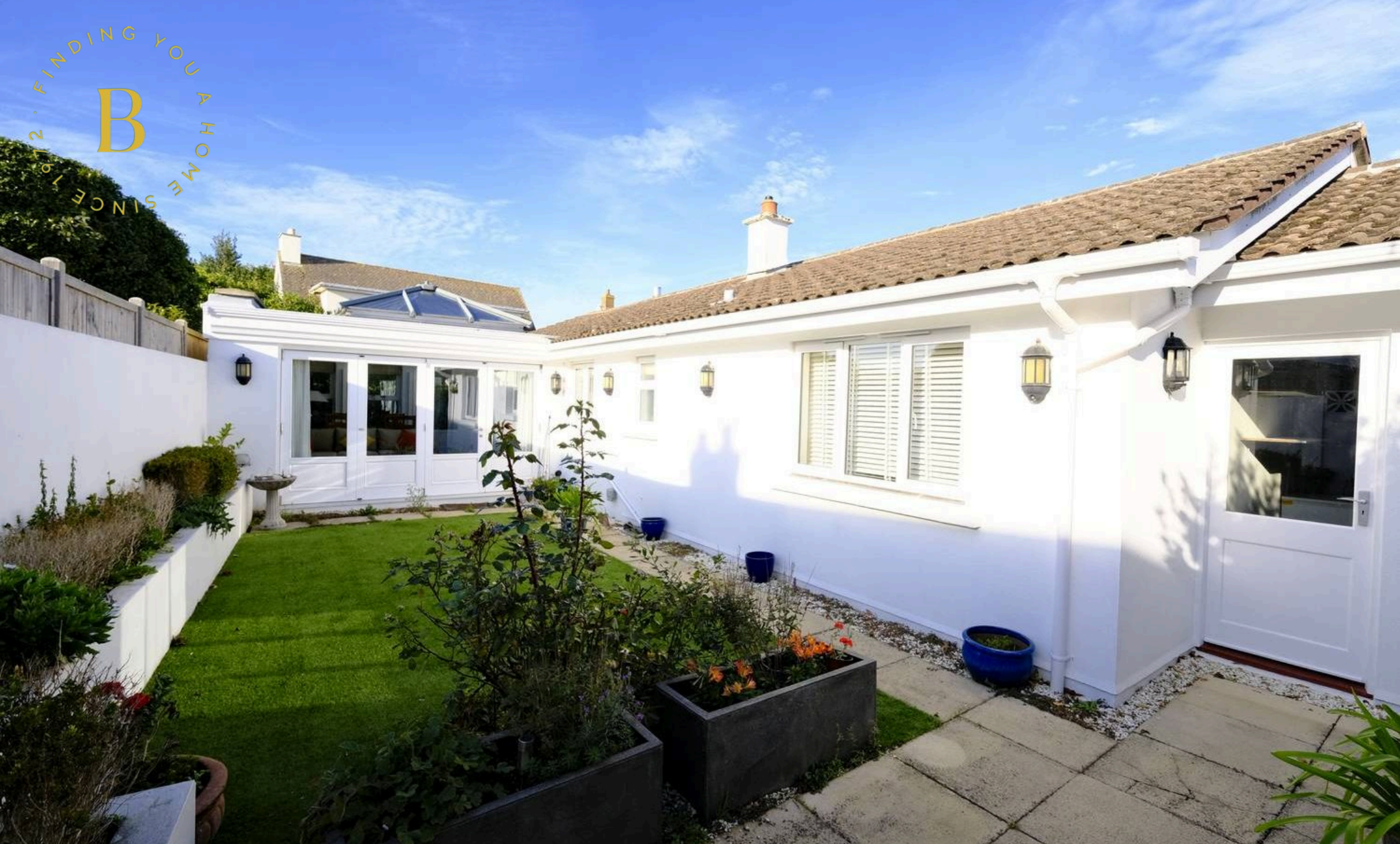
Mayerling, 1 Le Clos Sara £850,000

BROADLANDS FINDING YOU A HOME SINCE 1972