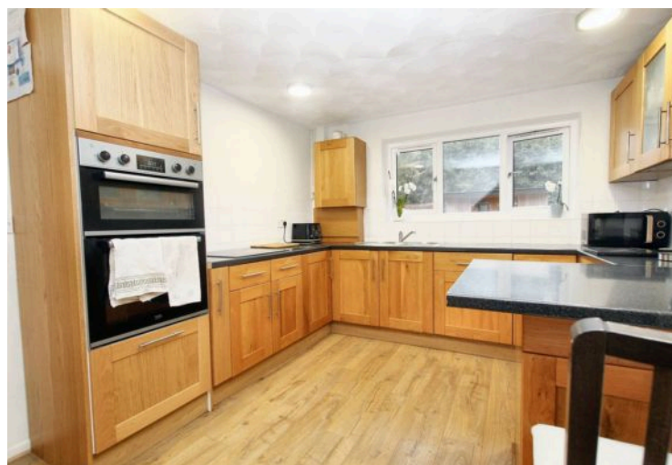
1 Cranberry Avenue, Todmorden £410,000 Freehold