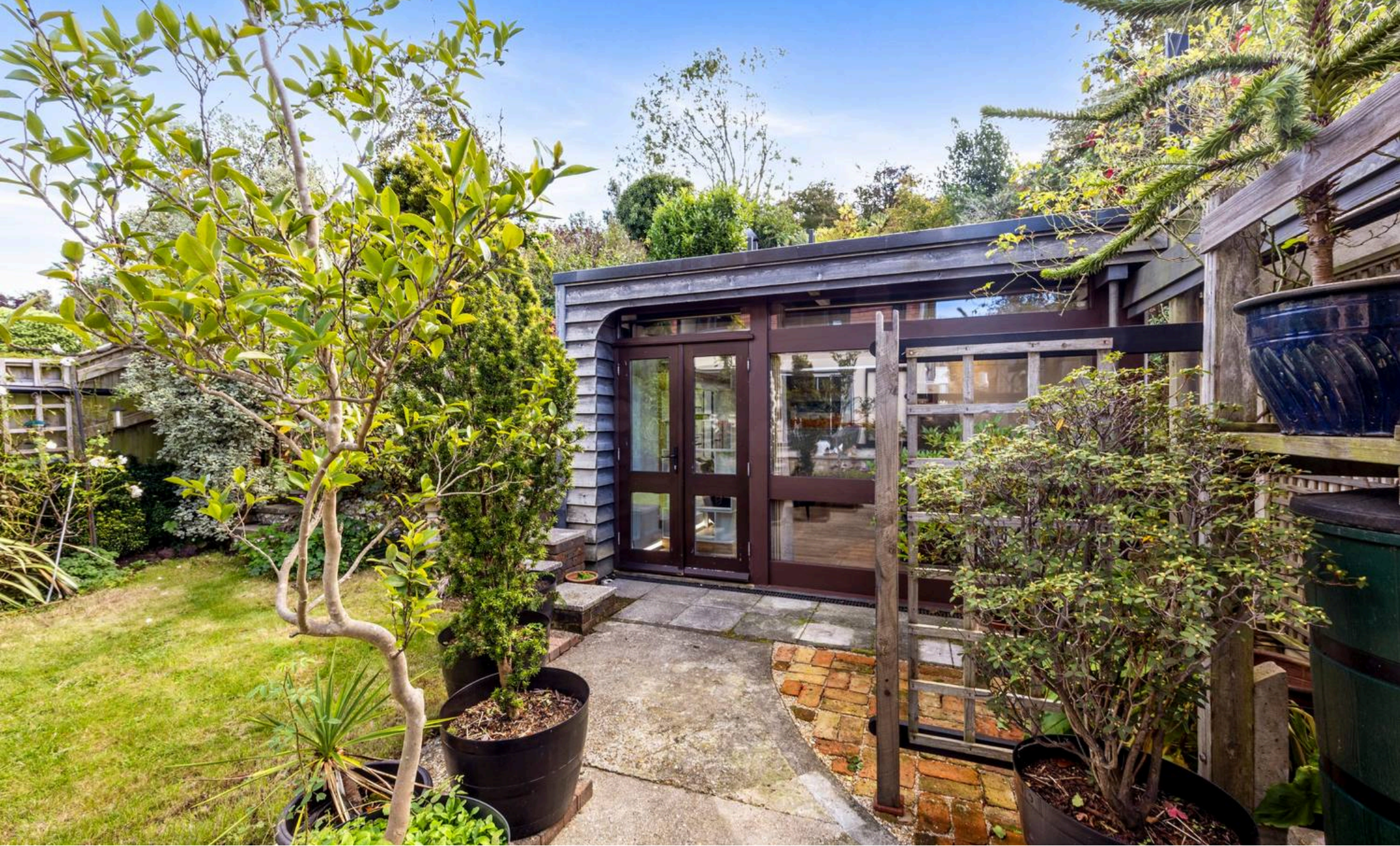
Annexe, 256 Mackie Avenue, Brighton BN1 8SD £1,000 pcm