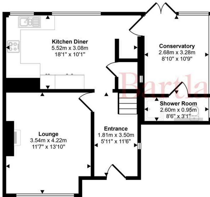
Ground Floor Approx 52 sq m / 561 sq ft

Approx Gross Internal Area 92 sq m / 985 sq ft