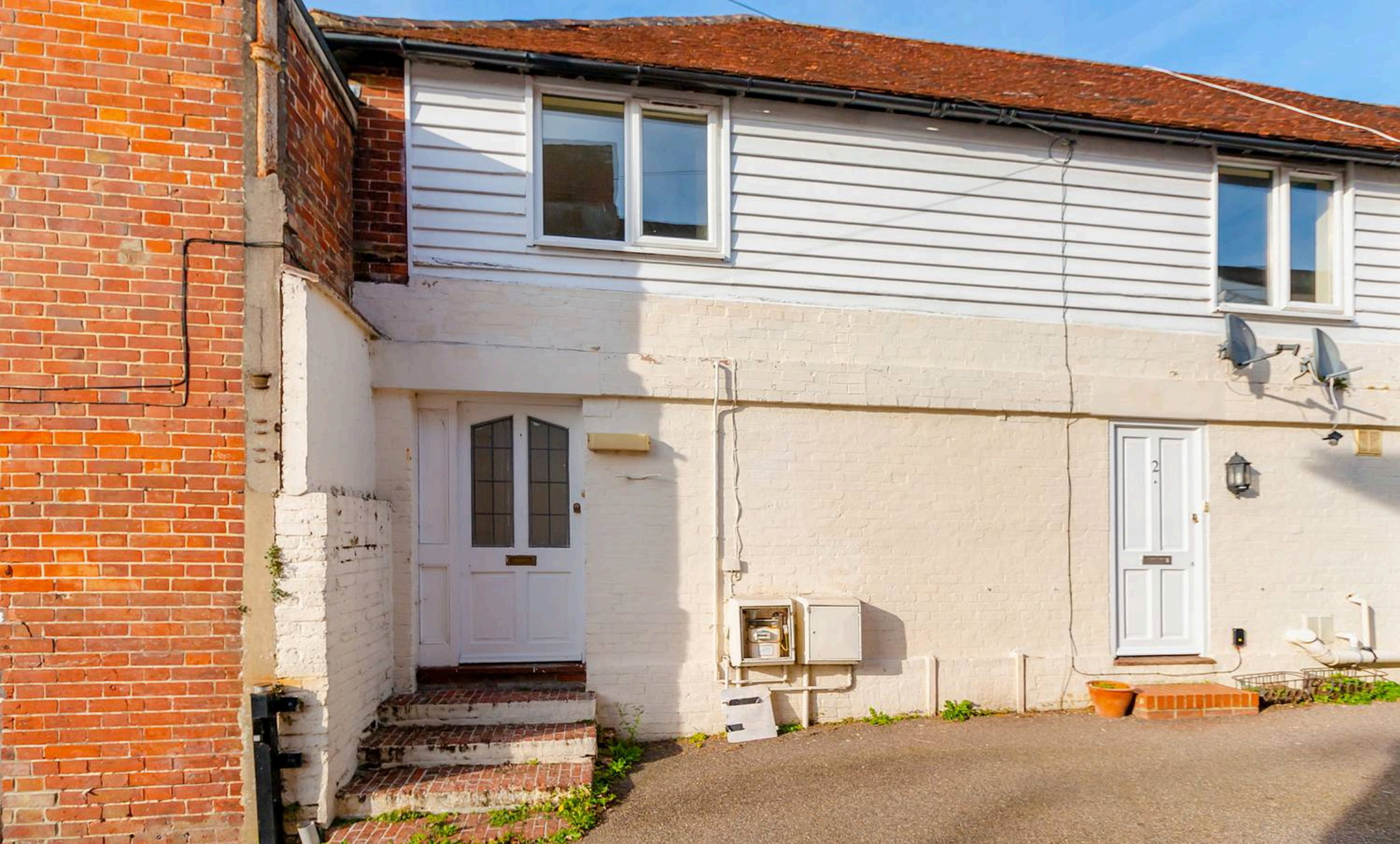
Flat 1, The Oasthouse, 54 New Town Uckfield