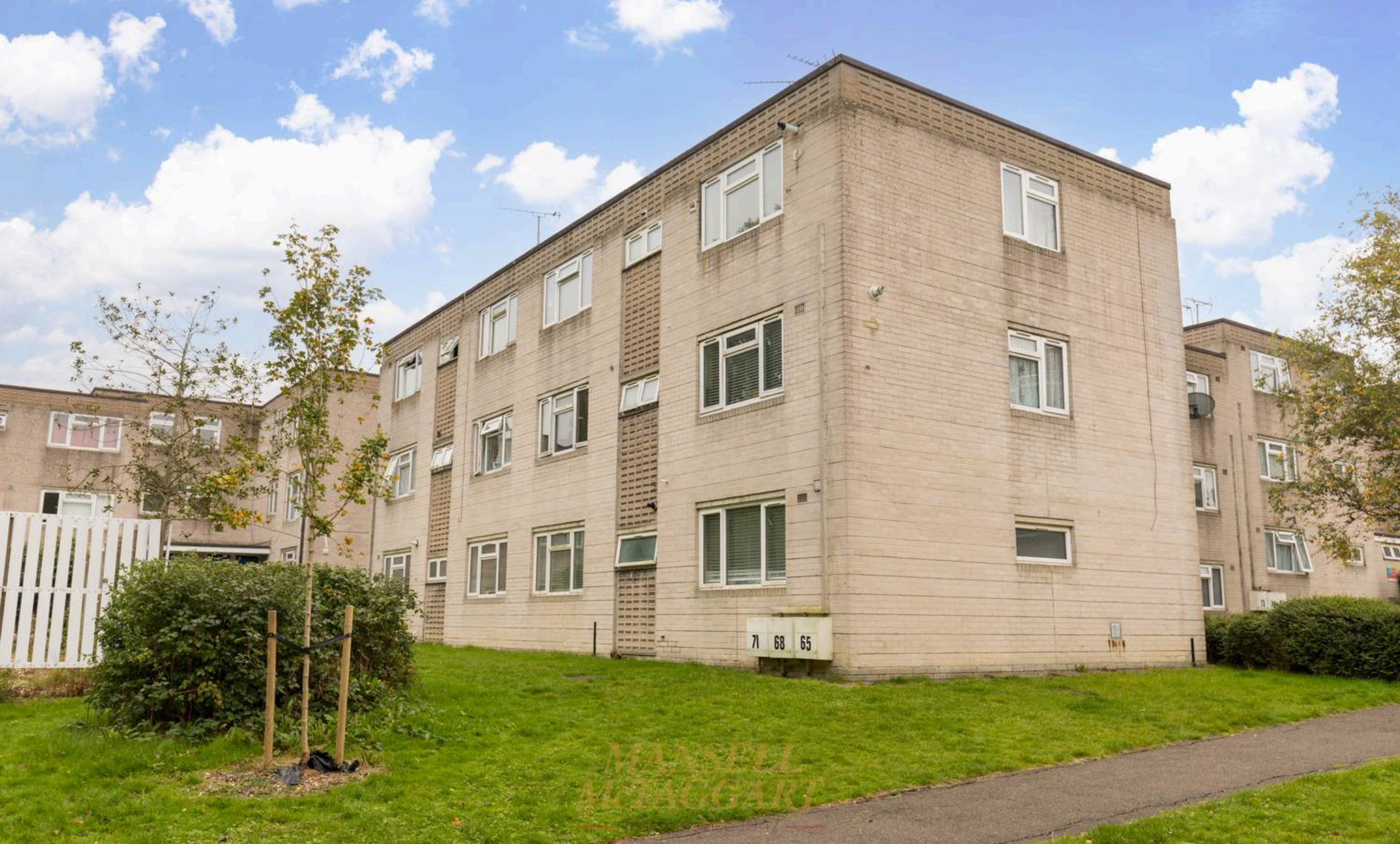
Caburn Court, Southgate £170,000

MANSELL McTAGGART — Trusted since 1947 —