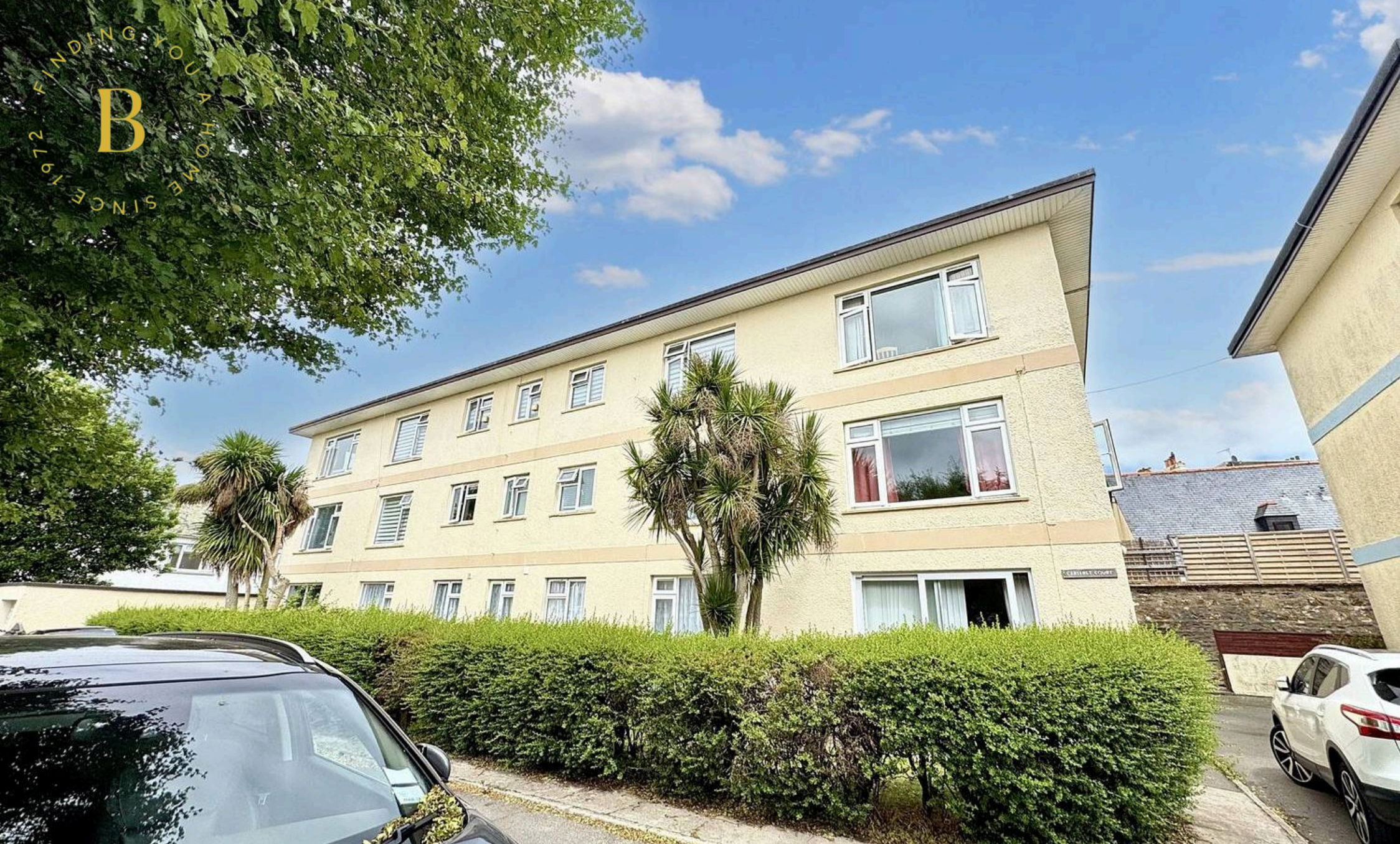
7 Carteret Court, Bagatelle Road, St. Saviour £199,000