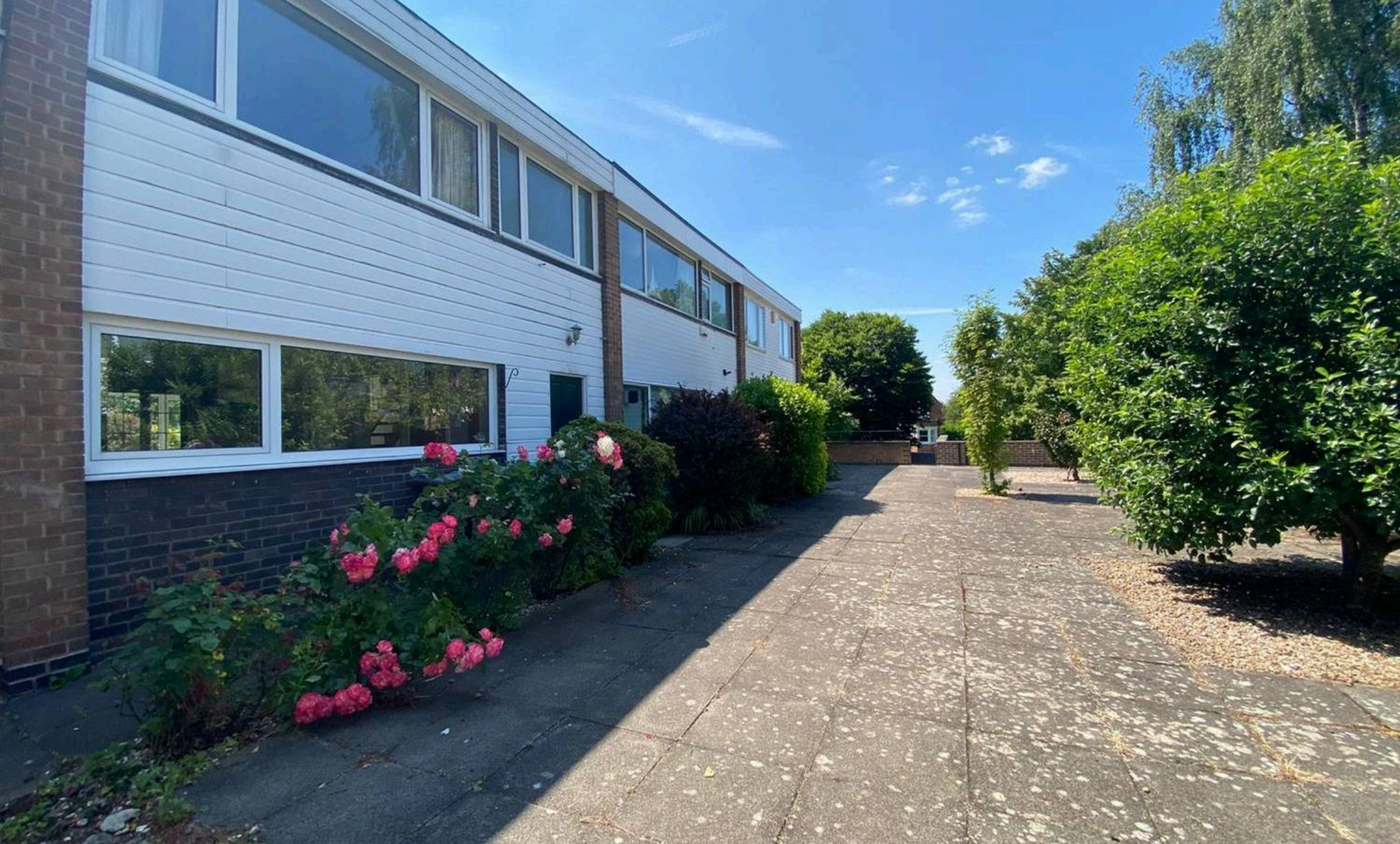
Yeomans Court Clumber Road West, Nottingham £1,295 PCM