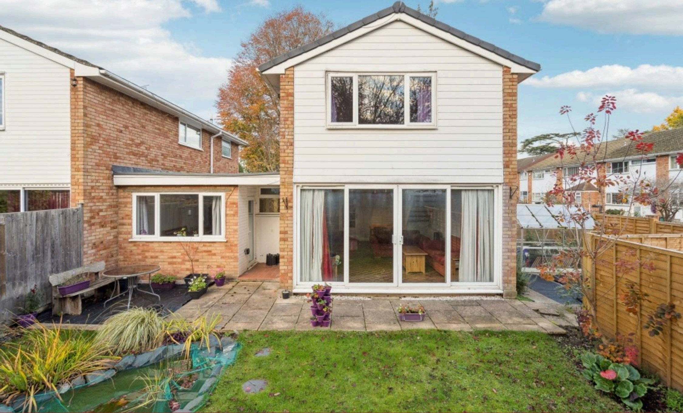
50 Wooburn Manor Park, Wooburn Green - HP10 0ES £650,000