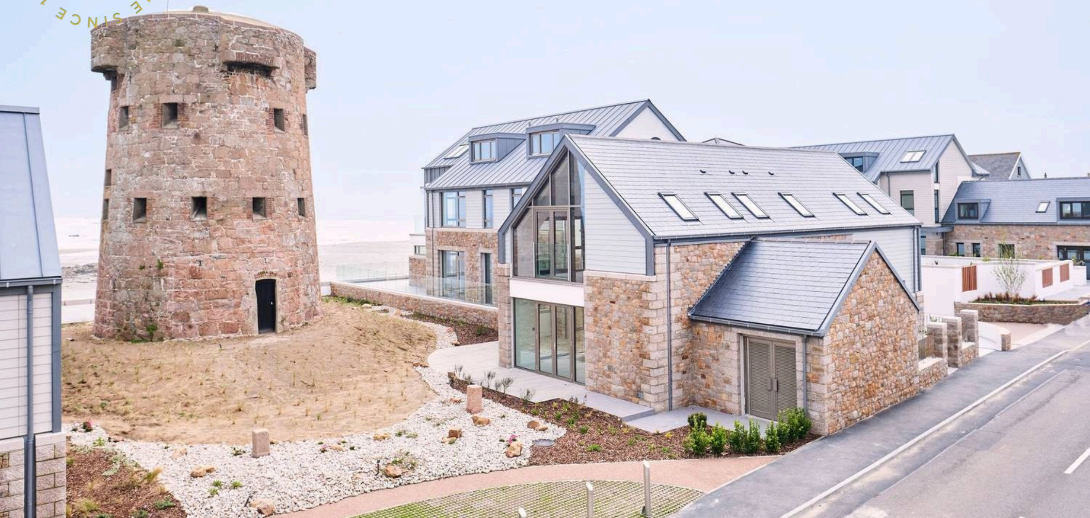
9 Keppel House, The Waves, La Grande Route Des Sablons, Gro BROADLANDS £2,145,000