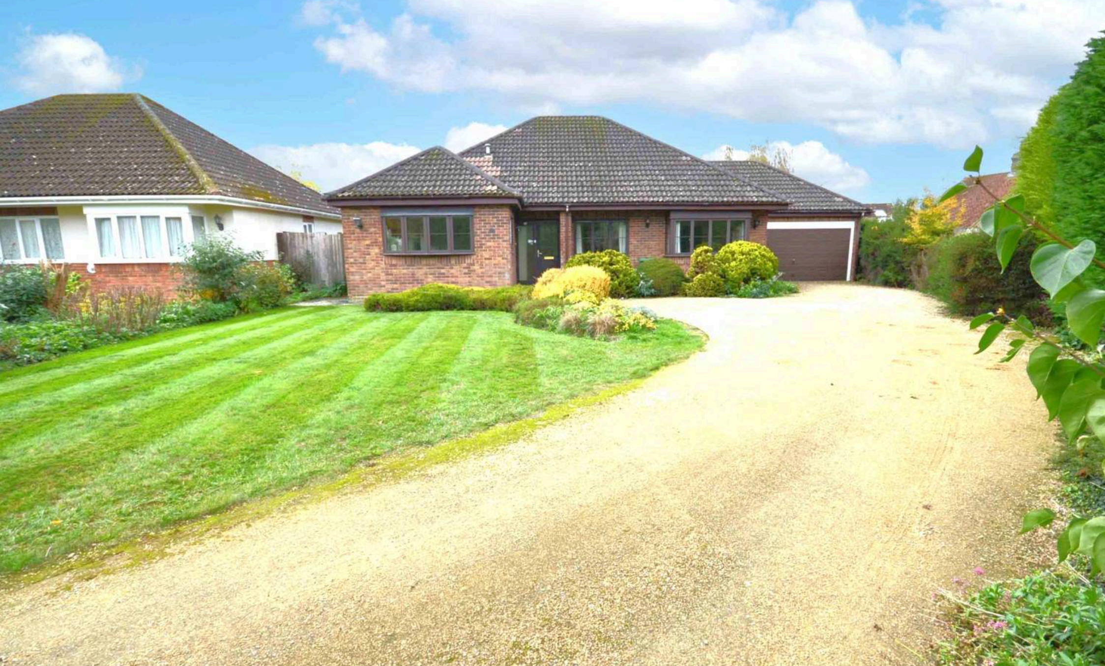
William Burt Close, Weston Turville £750,000