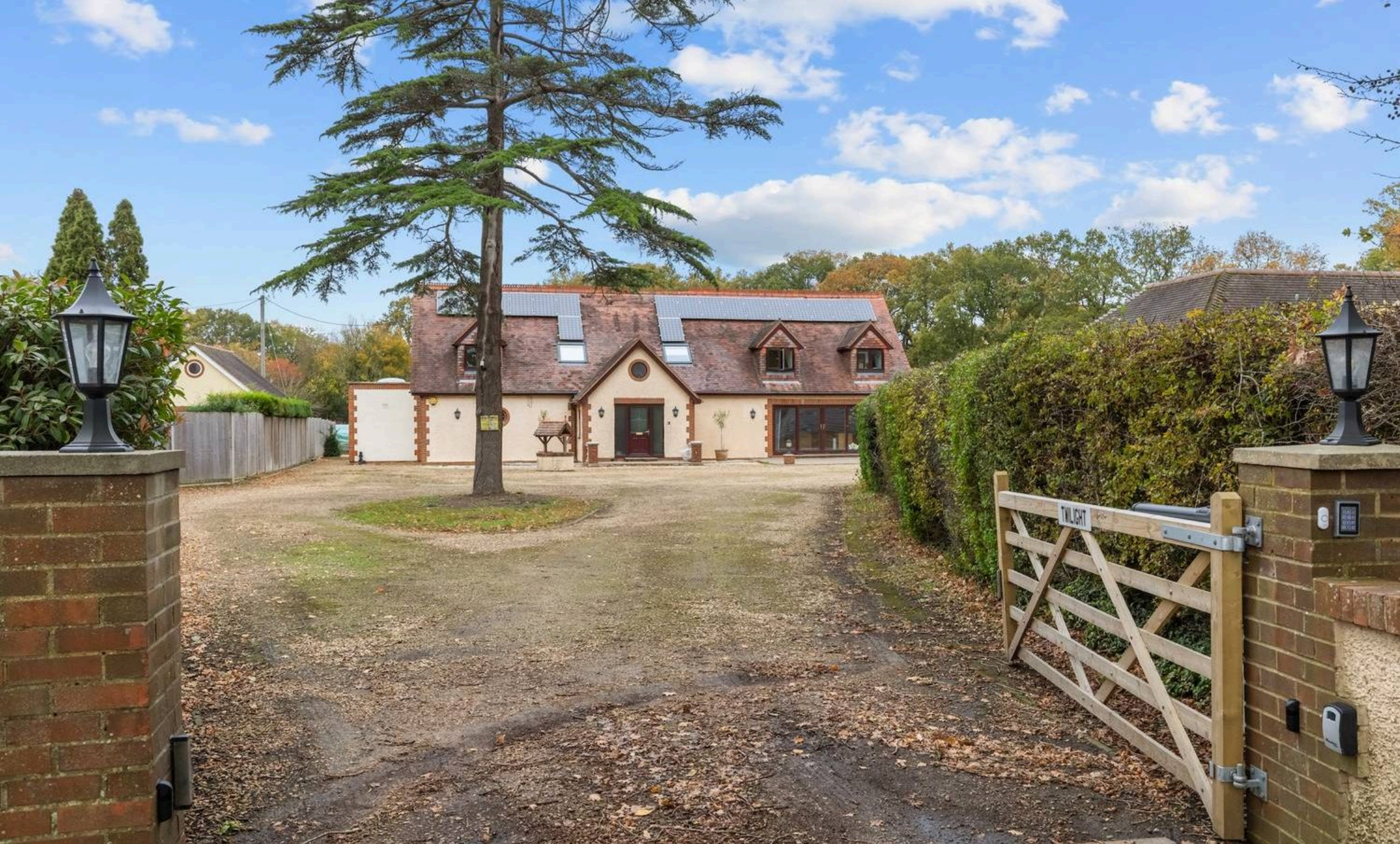
Twilight, Five Oaks Road, Slinfold, RH13 0RL