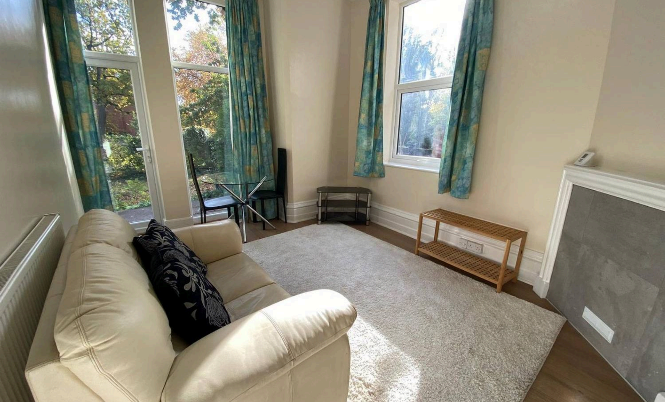
Park Lodge, Park Drive, Nottingham £900 pcm