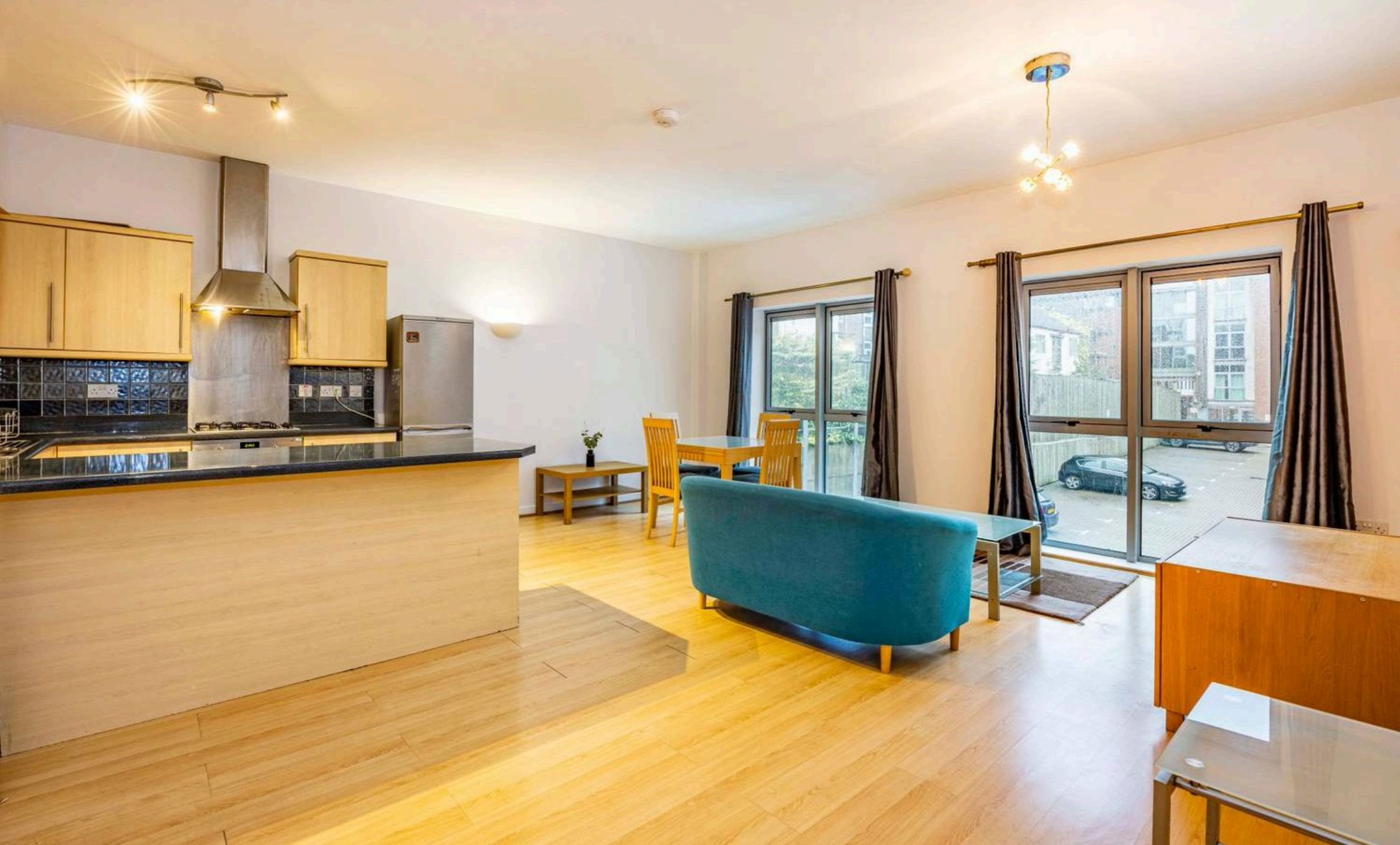
Portland Square, Portland Road, Nottingham £1,000 pcm