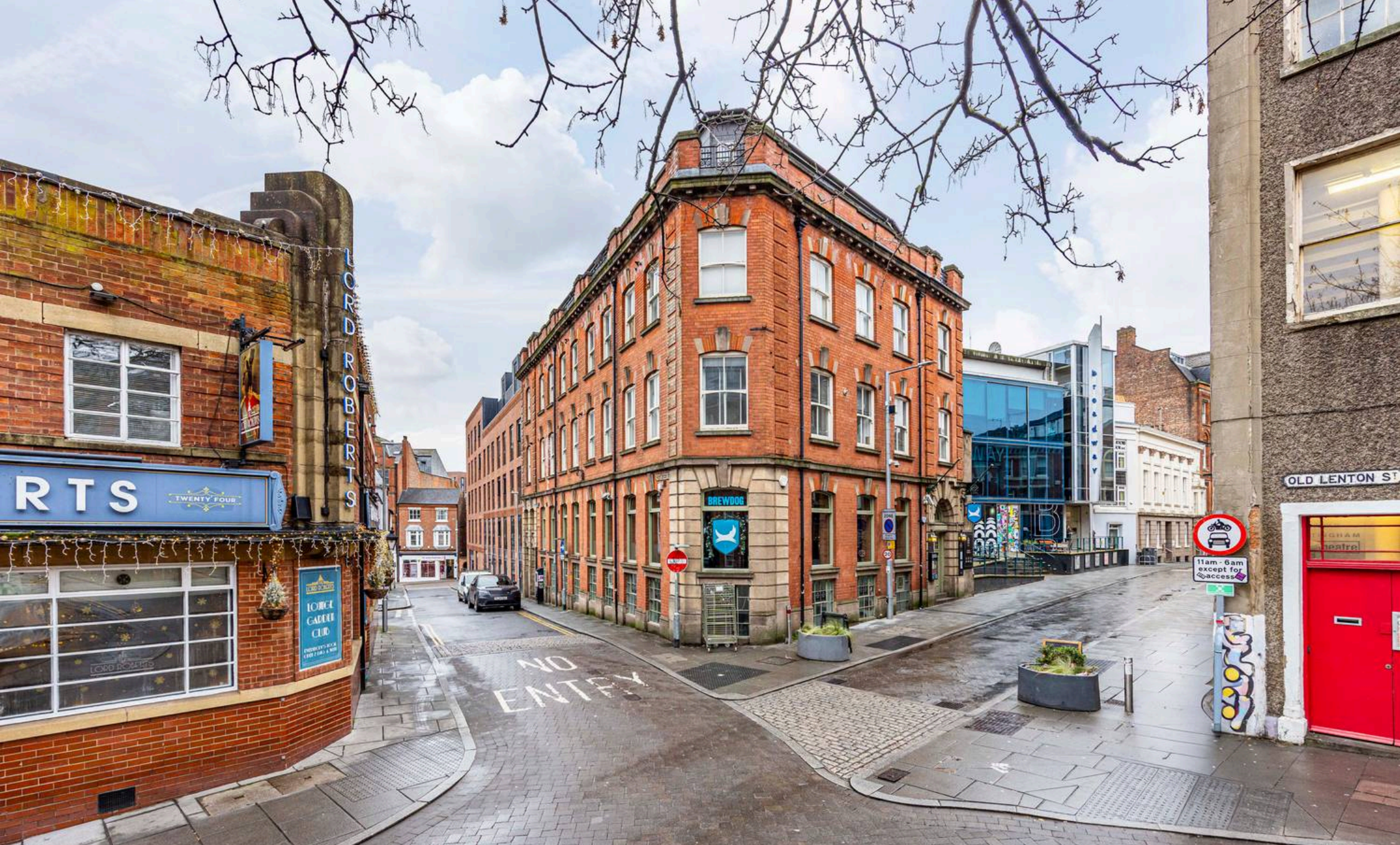
The Shaws Building, Broad Street, Nottingham £825 pcm