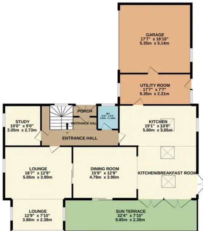
GROUND FLOOR 1597 sq.ft. (148.3 sq.m.) approx.